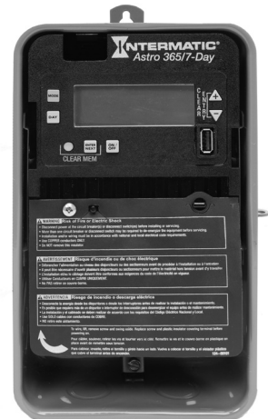
Shown in indoor/outdoor lockable metal enclosure

Follow these instructions to complete the installation and programming of the ET2805 time switch.