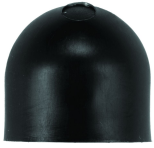
6LV1352 Light Shield Accessory for EK4036S, EK4436SM, K4000 Series Button Photocontrols