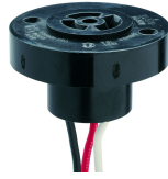
K121-30 Locking Type Receptacle, 3-Pin, C136.10 Compliant, 30" lead