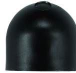
6LV1352 Light Shield Accessory for EK4036S, EK4436SM, K4000 Series Button Photocontrols