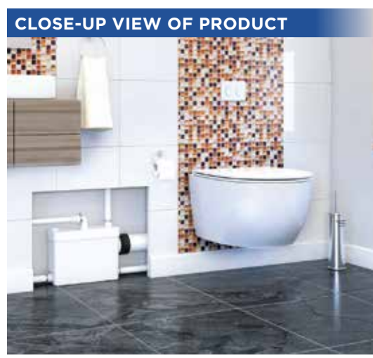
Example of installation, Follow local plumbing codes for actual install.

The Sanipack is a 1/2 HP pump system used to install a complete bathroom up to 15 feet below the sewer line, or even up to 150 feet away from a soil stack. It incorporates a macerating system which can handle human waste and toilet paper in residential applications. The blade is made out of a hardened stainless steel material which eliminates the need for any service or replacement.