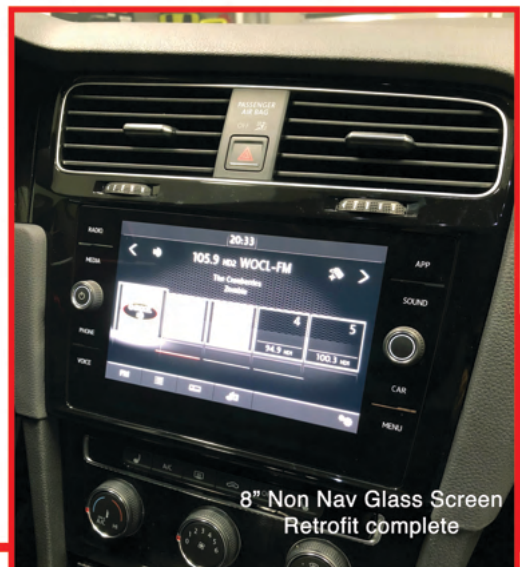
8" Non Nav Glass Screen Retrofit complete

Thank you for shopping with Eurozone Tuning!