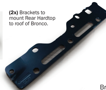
(2x) Brackets to mount Rear Hardtop to roof of Bronco.