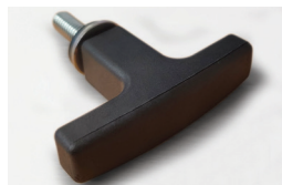
(8x) Quick Release T-Handles