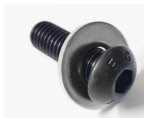
(6x) Bolts for the Bracket (softtops only).