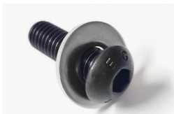
(6x) Bolts for the Bracket (softtops only).