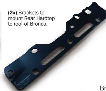
(2x) Brackets to mount Rear Hardtop to roof of Bronco.