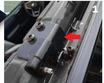
Bracket location/Top view