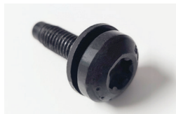
(2x) Bolts to mount Rear Hardtop to roof of Bronco.