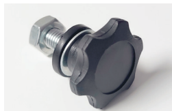
(8x) Quick Release Handles (nuts are NOT used).