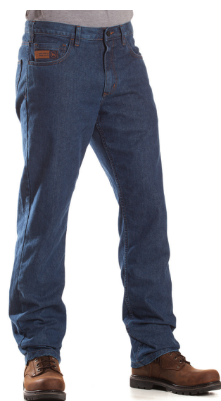
STYLE #2910FR DIRT ROAD DENIM Material: Benchmark FR Denim, 13.5 oz HRC/ARC Level 2 ATPV = 15 cal/cm 2 Sizes: W30 - W48 (Any Inseam) NFPA 2112 Colors: Stone Wash MSRP $70 99