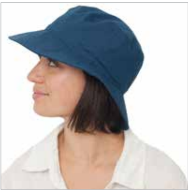
CRUSHER HAT 26022 sporty 2.75" sloped brim