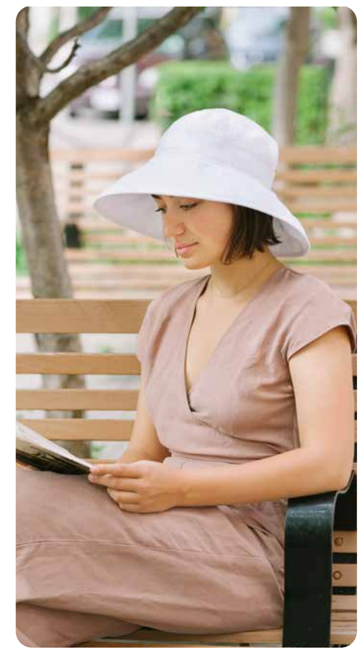
Baldwin Street, Toronto