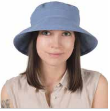
BOWLER HAT 21103 3" brim, round crown