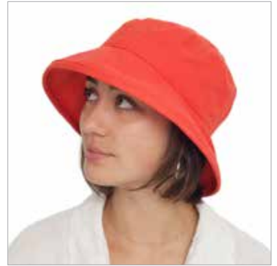
SLOUCH HAT 23972 3" brim