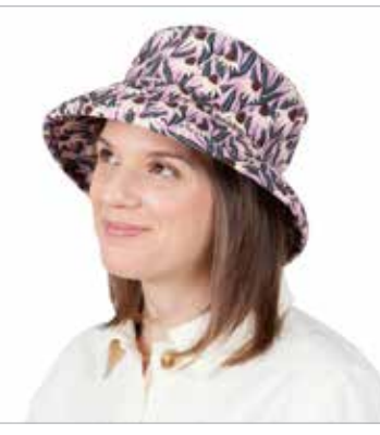
SLOUCH HAT 19102 3" brim- coneflower