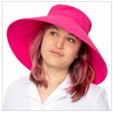
STARLET HAT 26022 6" brim for maximum sun protection