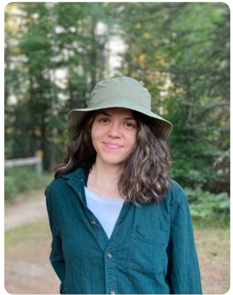
Crusher Hat | Algonquin Provincial Park