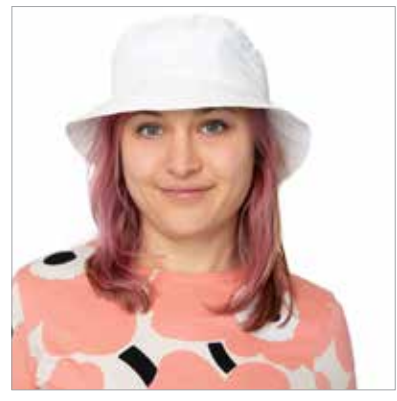
BUCKET HAT 22105 narrow 2" sloped brim