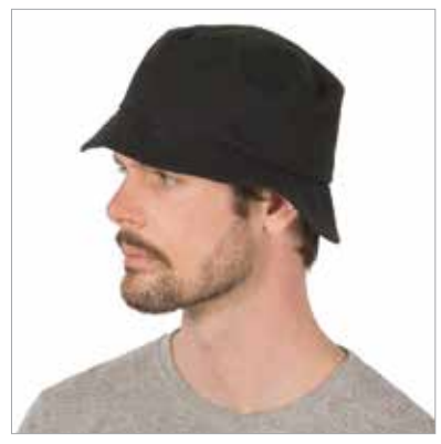
BUCKET HAT 21104 2" slopped brim