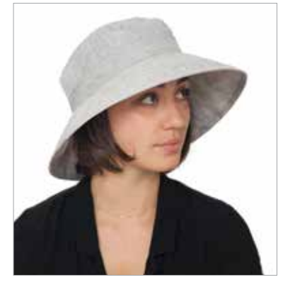
GARDEN HAT 15021 oval crown with 4" brim