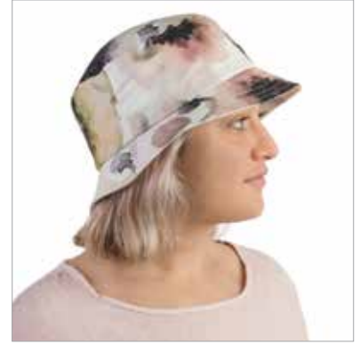
BUCKET HAT 21006 2" brim (bloom)

Beautiful prints evoking images of a lush summer garden. 100% linen