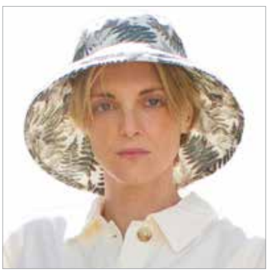
GARDEN HAT 19101 4" brim- fern garden