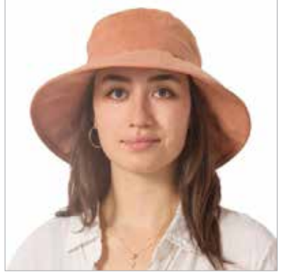
GARDEN HAT 21102 4" brim, oval crown