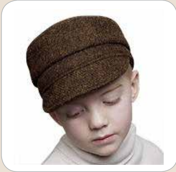
10503 - Cap Timeless Peaked Cap for an Autumn Day. XS,S,M,L