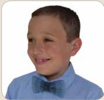
18505 - Bow Tie Add a touch of classic style to a button up shirt. Adjustable contrast band. one size