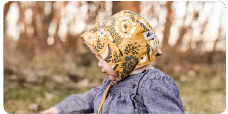
18110 - Harvest Bonnet with cozy organic flannel lining NB, 3mth,6mth,XXS,XS