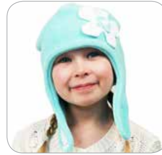
MOD FLOWER 13131