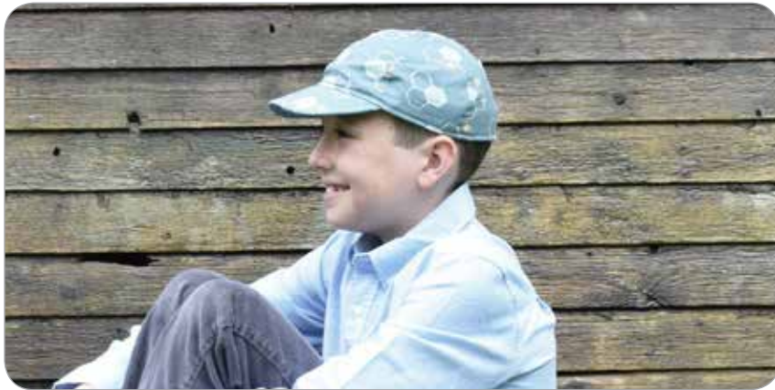
18108 - Harvest Cap XXS,XS,S,M

Certified Organic Cotton and Linen Caps, Bonnets, Bibs and Pacifier Clips in Beautiful Autumn Harvest Prints and Colours for Infants and Children