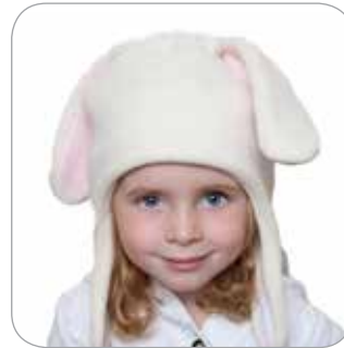
SNOW BUNNY 11469