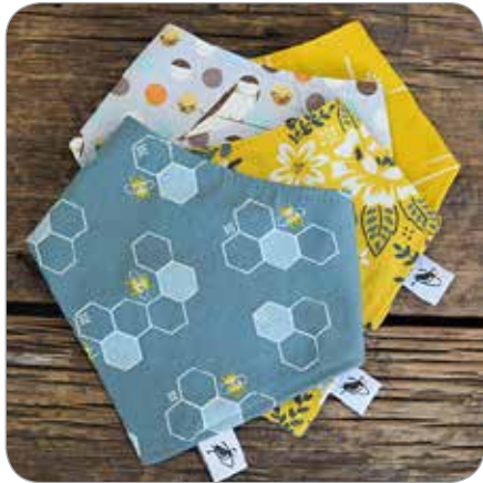
16205 - Harvest Bib with absorbant organic jersey reverse side