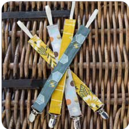
16203 - Harvest Pacifier Clip in co-ordinating harvest prints