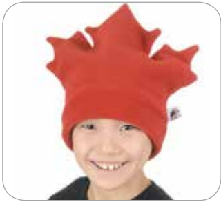
Maple Leaf Toque 24655