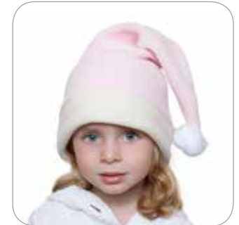
SANTA BABY 13130