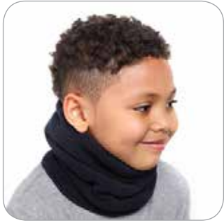
Neck Warmer 24568