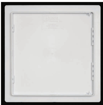
PA-3000 View of door back