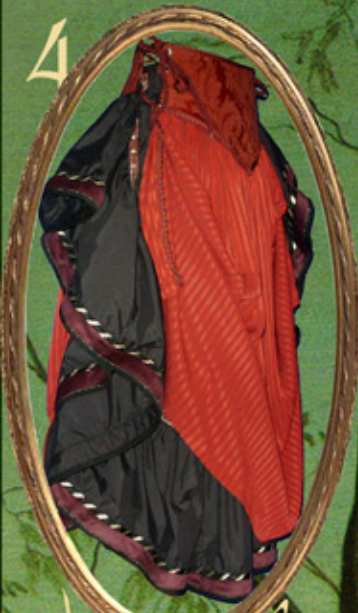
slip two over gypsy