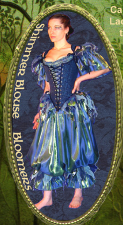
Shimmer Blouse Bloomers