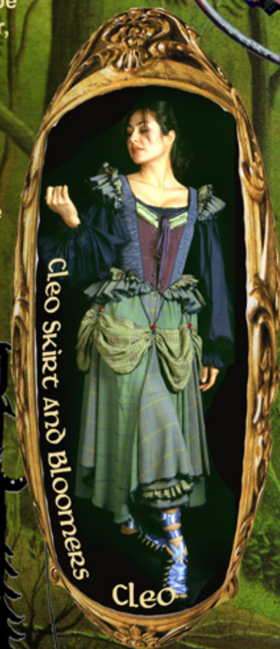
Cleo Skirt and Bloomers