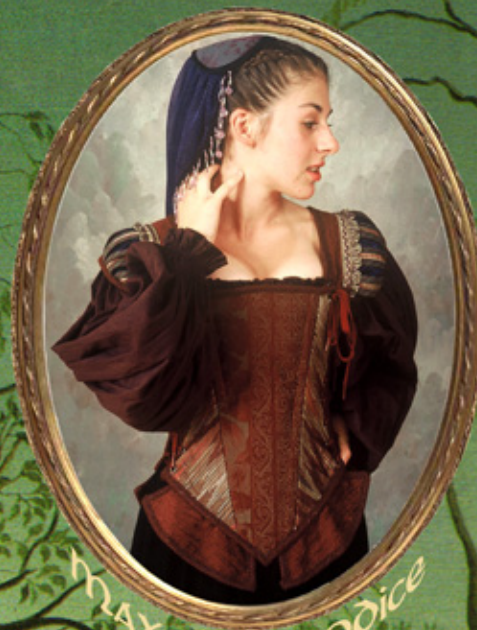
MAX TWO BODICE