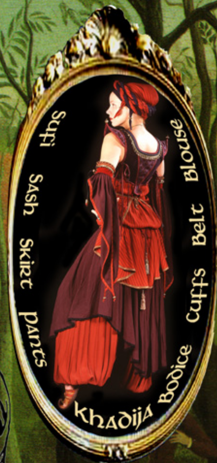
Supri Sash Skirt pants Bodice

Flyers from 2003, 2004, 2005 and 2006 are available on request. They are now our only printed catalog.