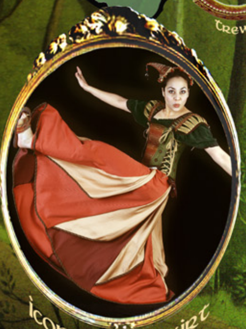
icon scroll skirt