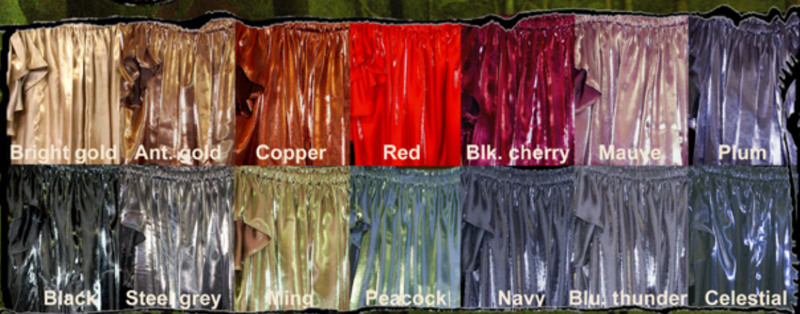
Bright gold Ant. gold Copper Red Blk. cherry Mauve Plum Black Steel grey Mind Peacock Navy Blu. thunder Celestial