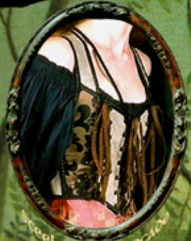
steel bone bodice

A typical large order, for a wedding, say, consists of one or more custom pieces (bride and groom, perhaps), several stock items: Cottes or skirt-blouse-bodice for brides maids, breech and shirts for ushers, and sometimes on-sale stuff as well. It ALWAYS adds up to a fraction of most conventional (or decent period) wedding attire. The same applies to orders for performing groups and single items for individuals.