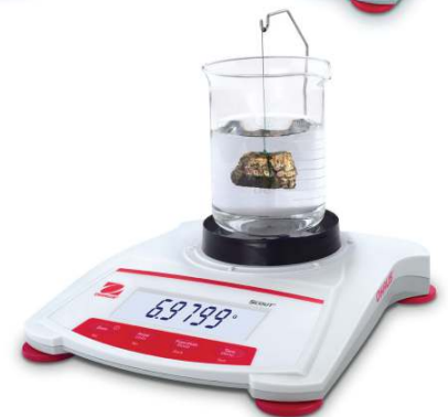
Scout shown with optional Density Determination Kit

It's all about accuracy and efficiency with the OHAUS Scout balance. Stabilization time as fast as 1 second combined with high resolution deliver extremely precise and repeatable weighing results that you can count on time and time again. This makes the Scout ideal for routine experiments and other weighing applications in your classroom.