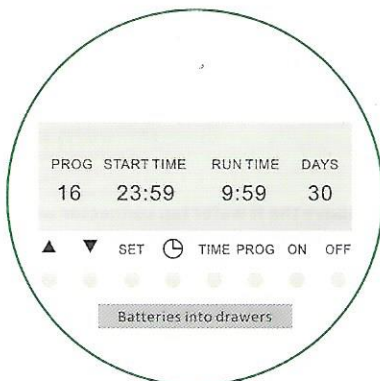
Dry battery LED timer