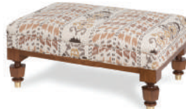
Lots Road Ottoman Pages 14–15