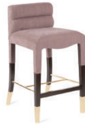
Gardner Counter-Height Stool Pages 22–23