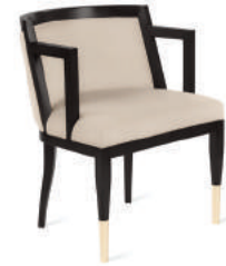
Steinbeck Arm Chair Page 24