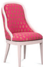
Frenchie Side Chair Pages 36–37