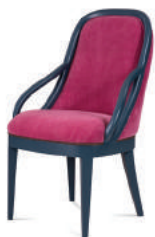
Frenchie Arm Chair Pages 36–37