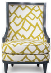
Royale Wing Chair Pages 32–33