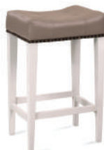
Cocktail Bar/Counter Stool Page 41