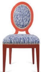
Parisienne Side Chair Page 35