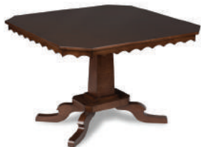
Murdock Anywhere Table Pages 10–11