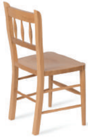
Irish Chair Page 8