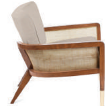
Grant Lounge Chair Pages 20–21