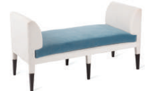
Hayworth Bench Pages 28–29