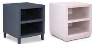
Elza End Table Page 39