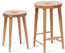
Milkmaid Bar/Dining/Counter Stool Page 9