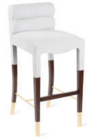
Gardner Bar-Height Stool Pages 22–23