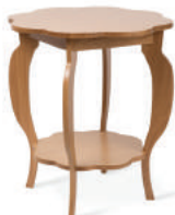
Scalloped Side Table Pages 12–13