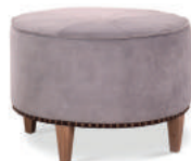
Ottoman Page 38