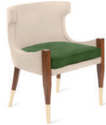
Vaughn Side Chair Pages 18–19