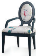
Parisienne Arm Chair Page 34