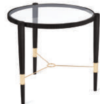
Getz Side Table Page 26