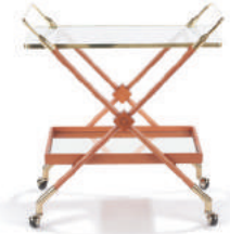
Hudson Bar Cart Page 25