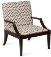
Lounge Lizard Lounge Chair Pages 6–7