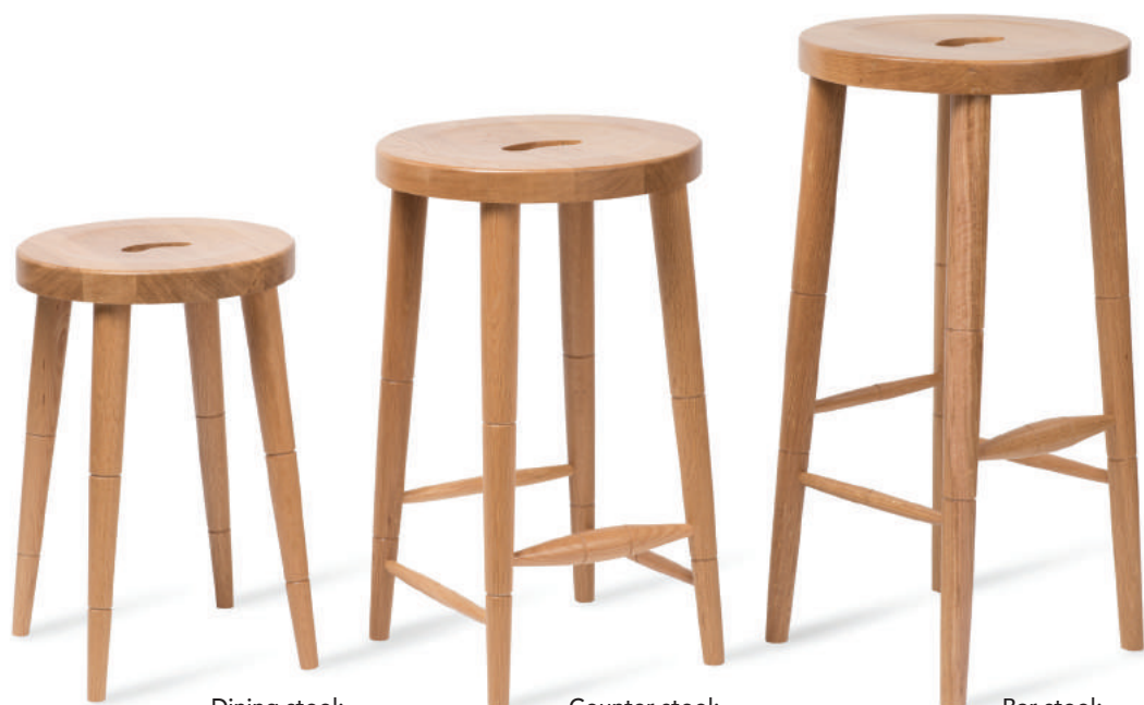
Dining stool: 13D x 19H

I started seeing little stools everywhere – pushed under coffee tables or tucked under an old trestle tables in a country kitchen. I just had to make a Mally version! They usually have only three legs, making them rather unstable, so these have four.