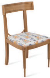
Aegean Klismos Side Chair Pages 10–11