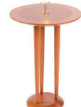
Danvers Snack Table Page 27