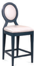
Bastille Bar/Counter Stool Page 40