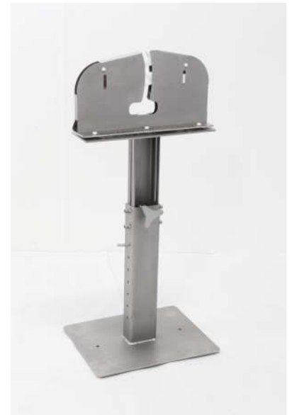
Article # 16999