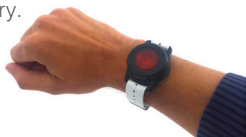
Worn with watch case and strap

On the front of the case is a rubberised button. On pressing the button the red LED will flash behind the rubber and an alert signal is sent. If the pendant isn't setting off the pager, or the red light isn't turning on when the button is pressed, you might need to change the battery. This is done by unscrewing the case in the same way and sliding the battery from the transmitter board and replacing with a new CR2 450 Lithium battery.