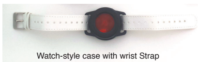
Watch-style case with wrist Strap