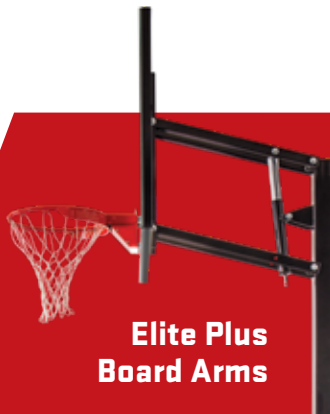
Elite Plus Board Arms