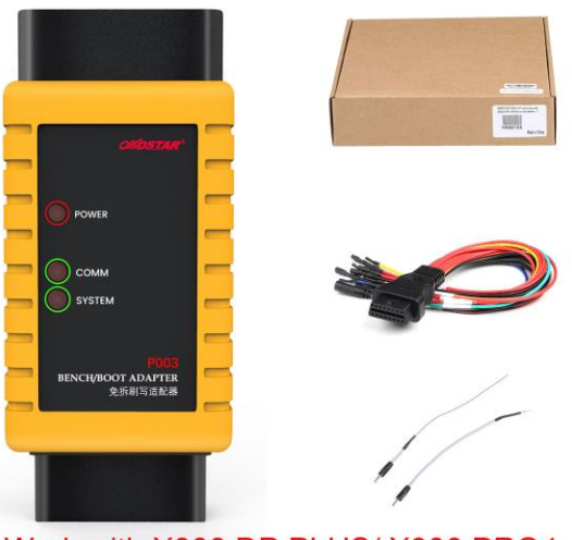
Work with X300 DP PLUS/ X300 PRO4

1pc x P003 adapter 1 set x ECU BENCH cables