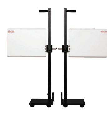
Front Wheel Targets (L&R) AUTEL-CSC0500-05