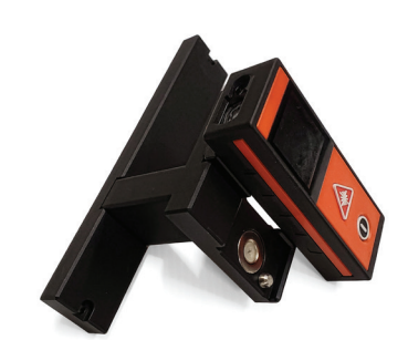
Center Digital Tape Measure Bracket AUTEL-CSC0500-05

Digital Tape Measure (3x) AUTEL-CSC0500-05