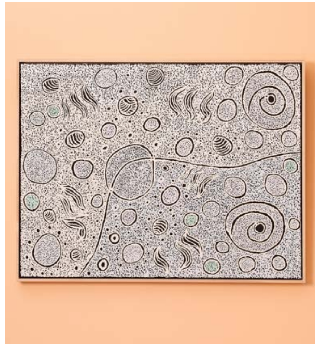
ART-22-892KA Minyma Kutjara by Marlene Connelly Acrylic on canvas / Timber frame 76.2 cm H x 101.5 cm W $2,200.00