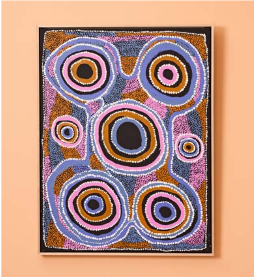
ART-23-236KA Kaltukatjara Rockholes by Rosalind Yibardi Acrylic on canvas / Timber frame 76.2 cm H x 101.5 cm W $2,350.00