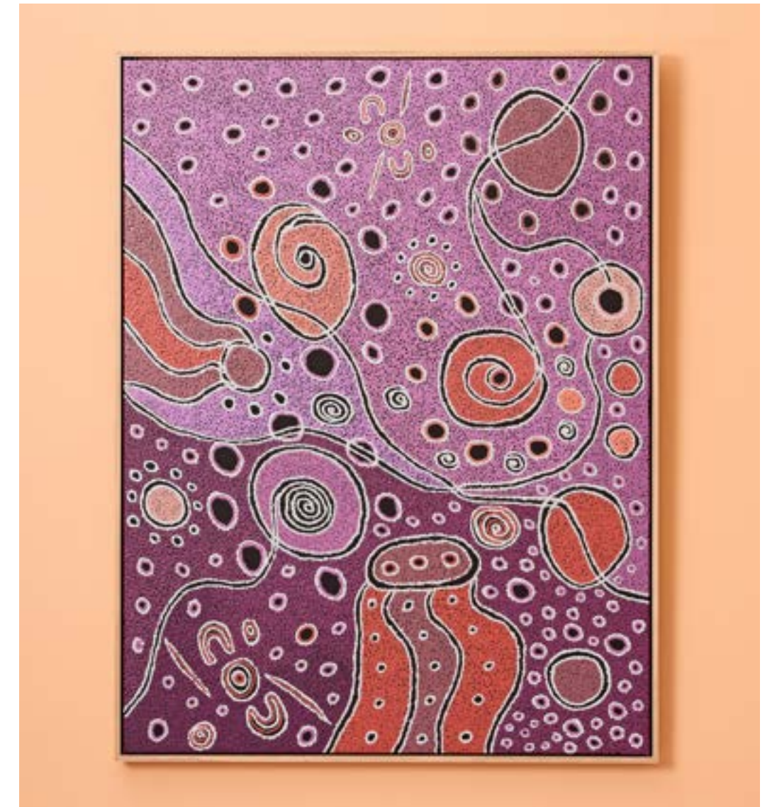
ART-23-172KA Minyma Kutjara by Marlene Connelly Acrylic on canvas / Timber frame 91.4 cm H x 121.9 cm W $3,100.00