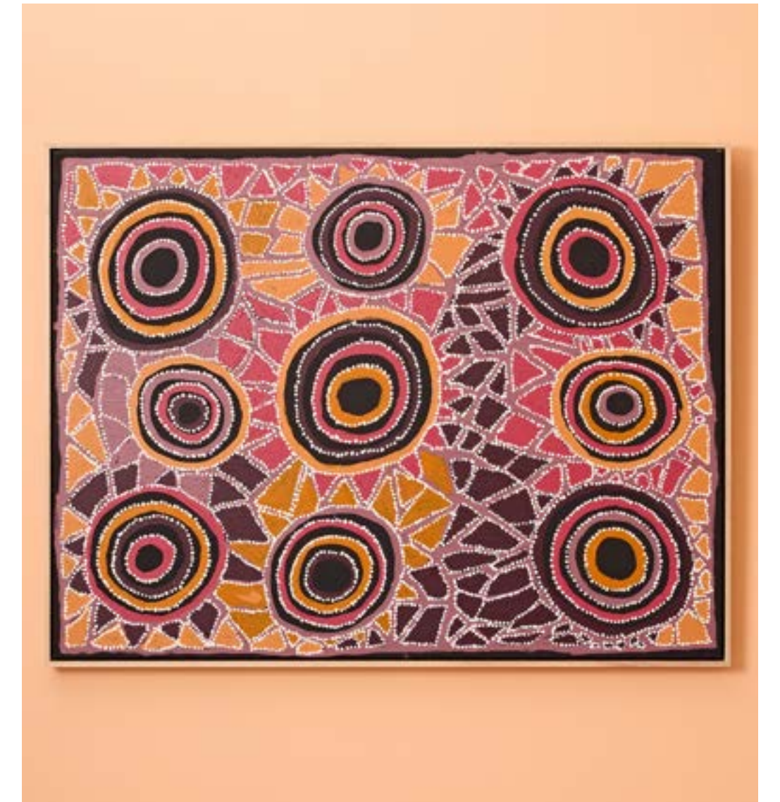
ART-23-169KA Kaltukatjara Rockholes by Rosalind Yibardi Acrylic on canvas / Timber frame 91.4 cm W x 121.9 cm W $3,100.00