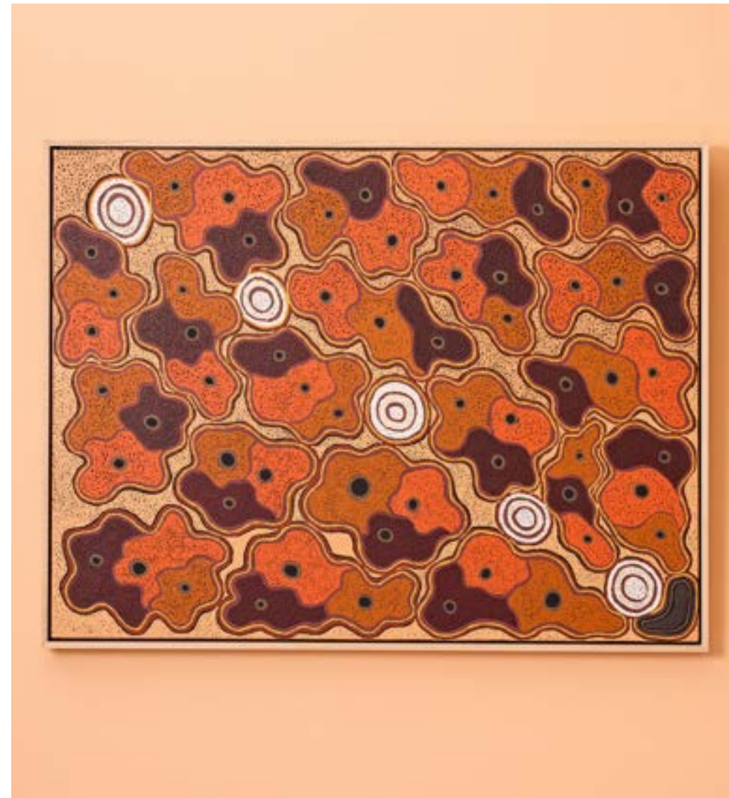
ART-22-1209KA Tjitjiku Kuru by Elsie Edimintja Acrylic on canvas / Timber frame 176.2 cm W x 101.5cm H $2,200.00