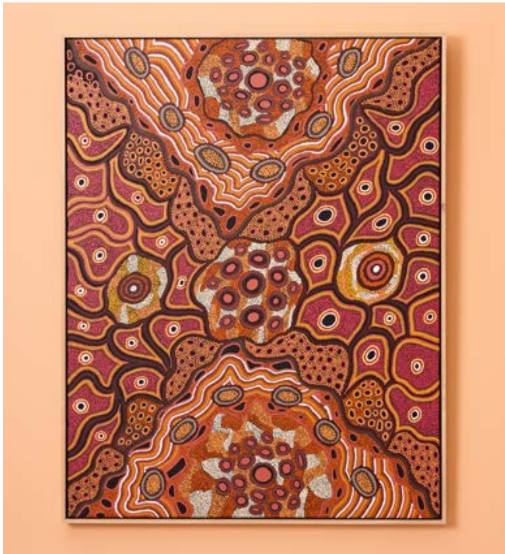
ART-23-168KA Kungka Kutjara by Elsie Edimintja Acrylic on canvas / Timber frame 191.4 cm H x 119.9 cm W $2,950.00