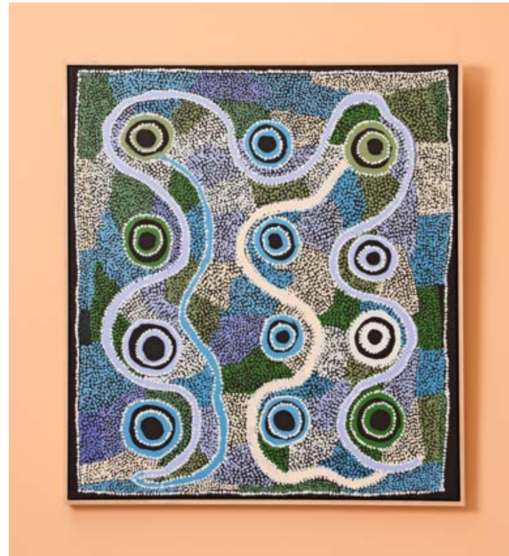
ART-23-231KA Kaltukatjara Rockholes by Rosalind Yibardi Acrylic on canvas / Timber frame 91.4 cm H x 121.9 cm W $2,800.00