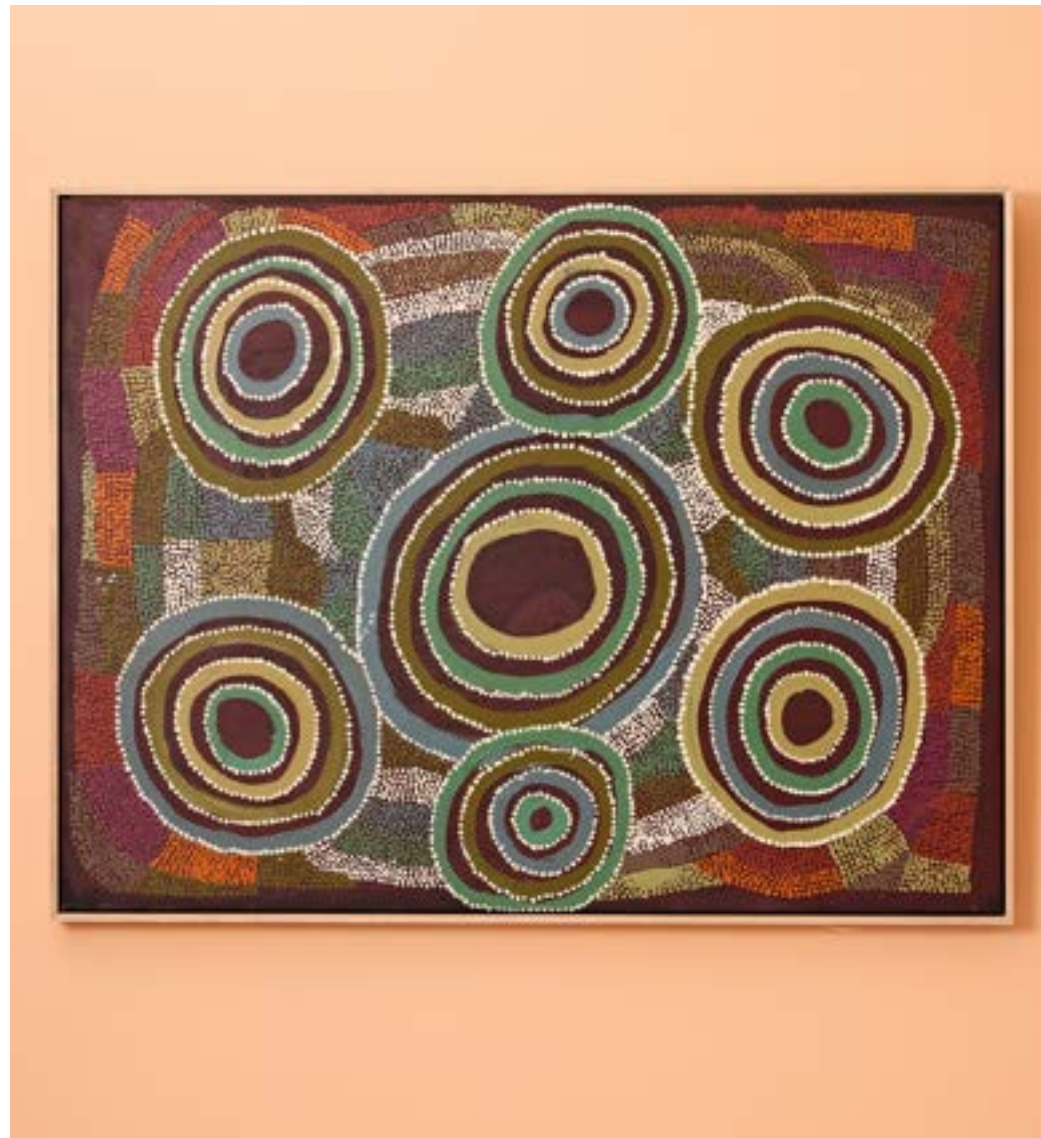
ART-22-1008 Kaltukatjara Rockholes by Rosalind Yibardi Acrylic on canvas / Timber frame 91.4 cm H x 121.9 cm W $3,100.00