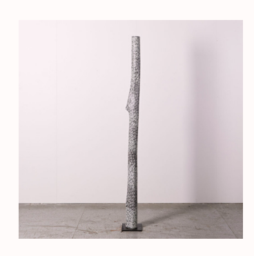
Bulwutja - ART-BUK-5780-19 Buku-Larrngay Mulka Centre Muluymuluy Wirrpanda Larrakitj 17cm (W) x 243cm (H) $8735