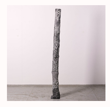
Bulwutja - ART-BUK-474-20 Buku-Larrngay Mulka Centre Muluymuluy Wirrpanda Larrakitj 22cmm (W) x 252cm (H) $10,320