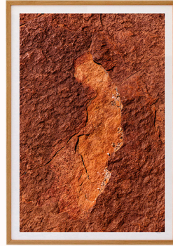
Desert Time #3 125cm x 88cm $1240