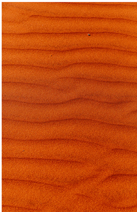
Above: Desert Time #7 Frame size: 125cm x 88cm $1240