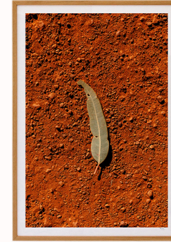
Desert Time #4 125cm x 88cm $1240