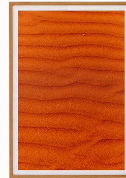
Desert Time #7 125cm x 88cm $1240