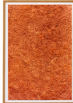
Desert Time #6 125cm x 88cm $1240