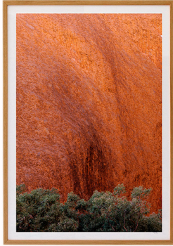
Desert Time #2 125cm x 88cm $1240