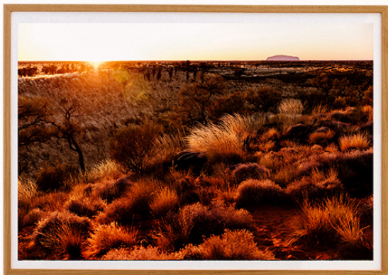
Desert Time #1