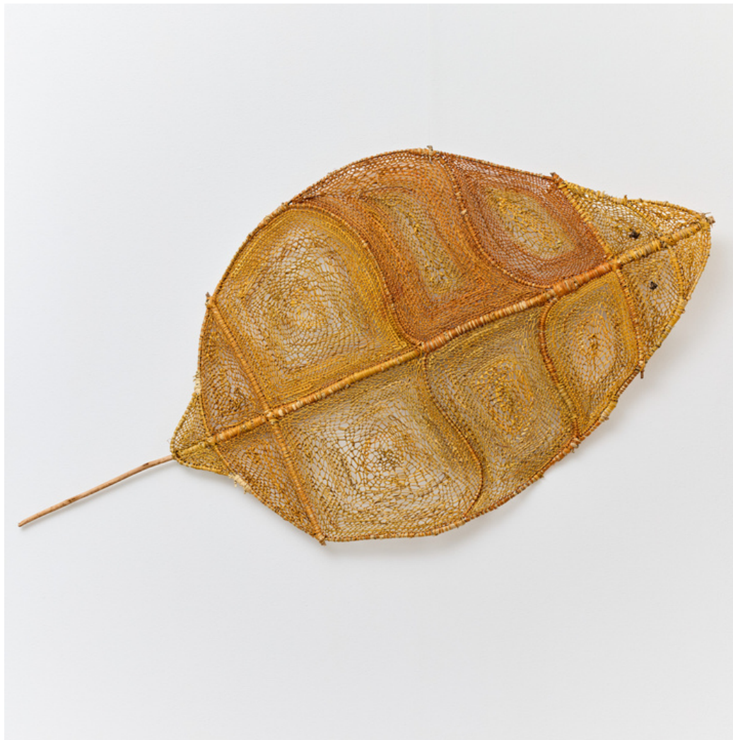
1287-23 Nawarlah - Brown River Stingray by Louanne Kandarra (Maningrida) Pandanus ( Pandanus Spiralis ) and Natural Dyes 65 cm H x 135 cm W $580.00