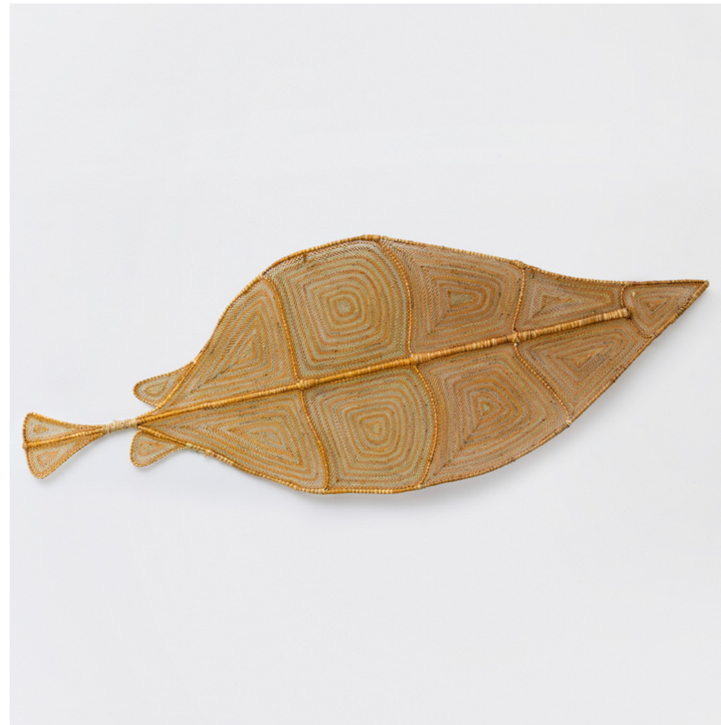
1068-23 Birlmu or Namarnkorl (Barramundi) by Samantha Malkudja (Maningrida) Pandanus (Pandanus Spiralis) and Bush Cane (Flagellaria Indica) with Natural Dyes 70 cm H x 195 cm W $2,920.00