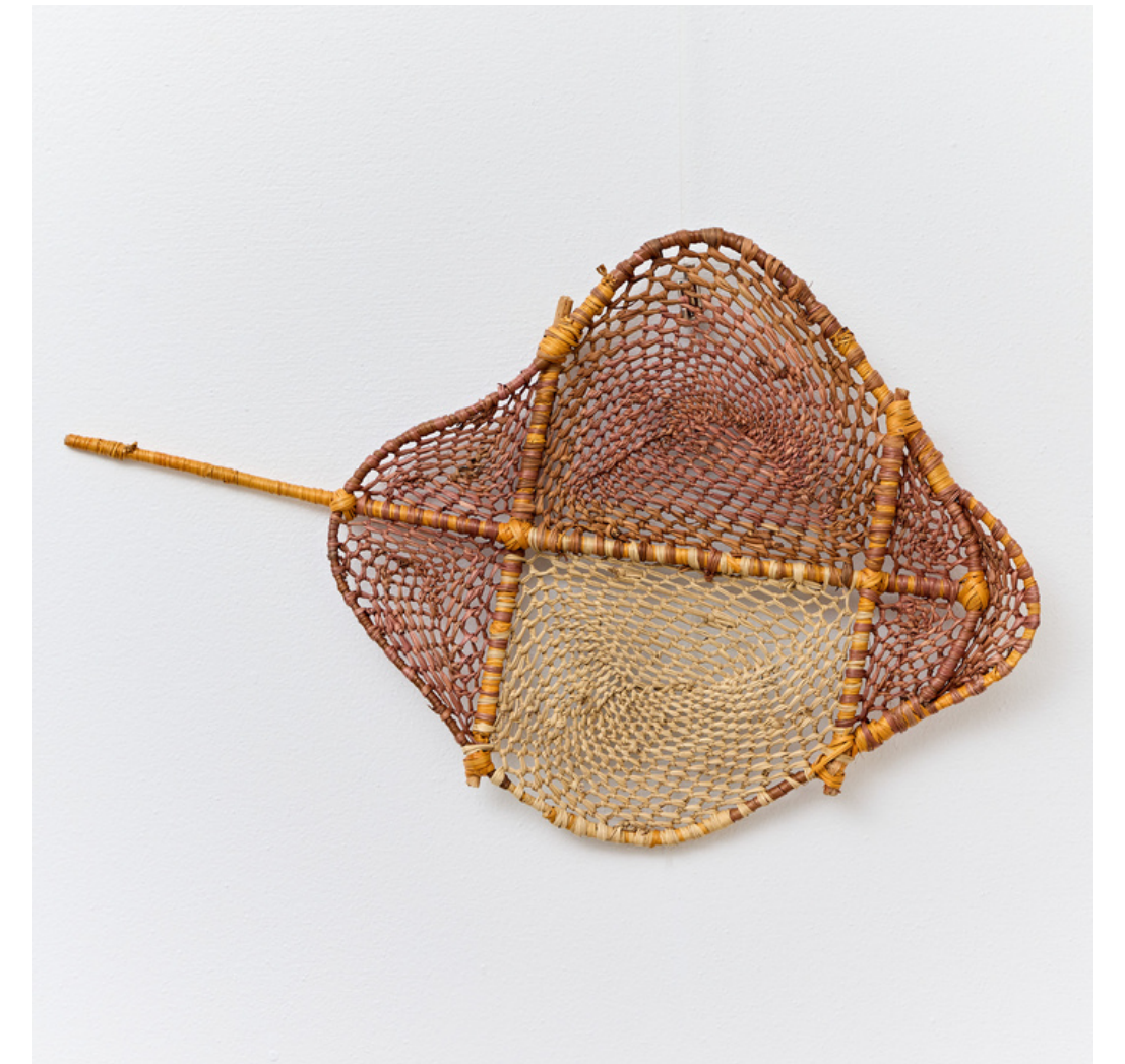
3244-22 Pandanus Weaving (Stingray) by Shirley Wurrkidj (Marrawuddi) Pandanus and Natural Dyes 32 cm H x 51 cm W $590.00