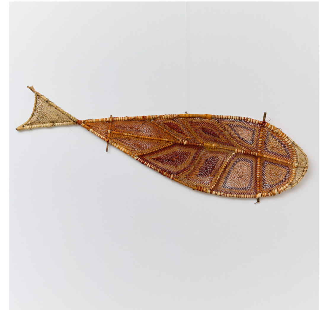
1082-23 Fibre Sculpture by Citrina Nulla (Maningrida) Pandanus (Pandanus Spiralis) and Bush Cane (Flagellaria Indica) with Natural Dyes 115 cm W $580.00