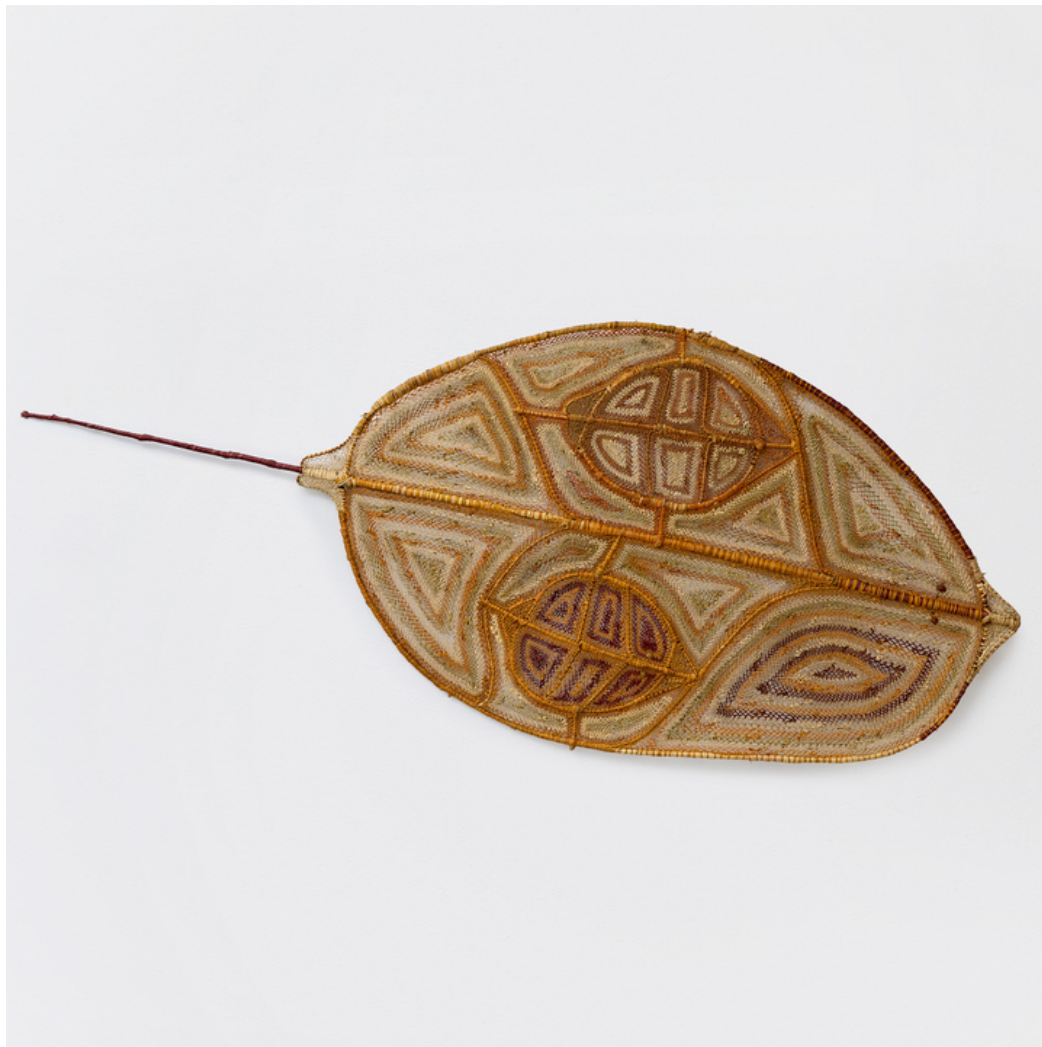
1053-23 Nawarlah - Brown River Stingray by Thomasina Dennis (Maningrida) Pandanus (Pandanus Spiralis) and Bush Cane (Flagellaria Indica) with Natural Dyes 96 cm H x 222 cm W $3,090.00