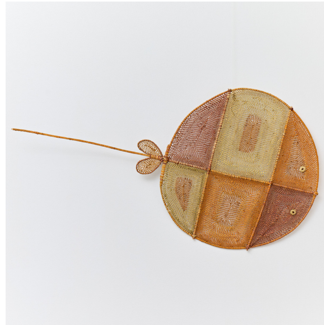
1882-23 Pandanus Weaving (Stingray) by Philemon Wanambi (Marrawuddi) Pandanus and Natural Dyes 62 cm H x 69 cm W $780.00