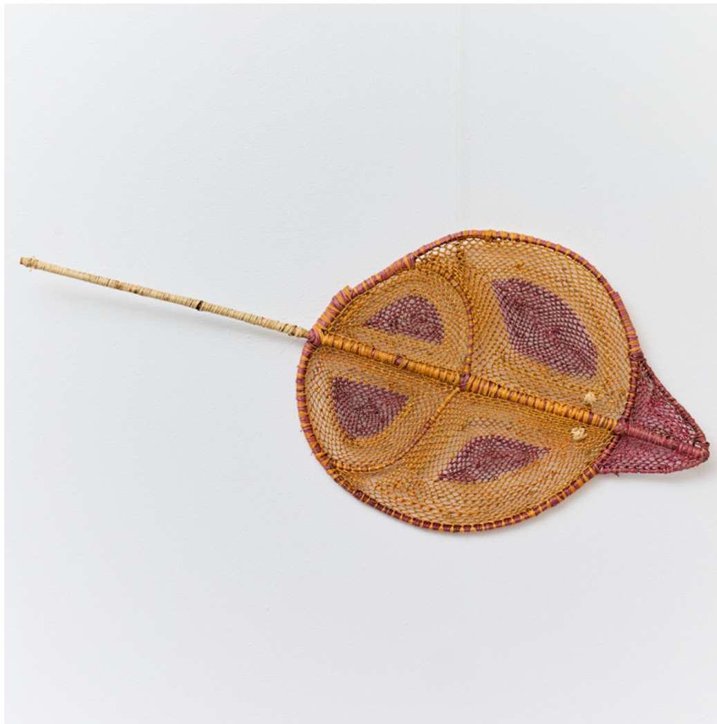
2761-22 Pandanus Weaving - Nawarlah (Stingray) by Shirley Wurrkidj (Marrawuddi) Pandanus and Natural Dyes 35 cm H x 47 cm W $710.00