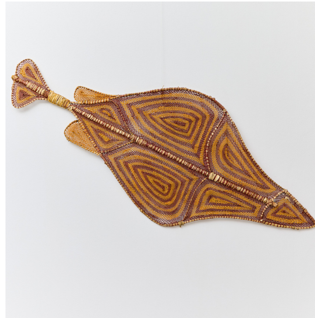
841-23 Birlmu or Namarnkorl (Barramundi) by Samantha Malkudja (Maningrida) Pandanus (Pandanus Spiralis) and Bush Cane (Flagellaria Indica) with Natural Dyes 140cm L $1,290.00