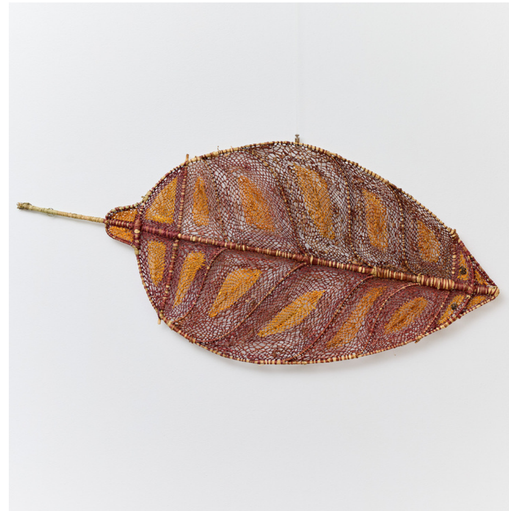
1288-23 Nawarlah - Brown River Stingray by Louanne Kandarra (Maningrida) Pandanus (Pandanus Spiralis) and Natural Dyes 50 cm H x 115 cm W $430.00