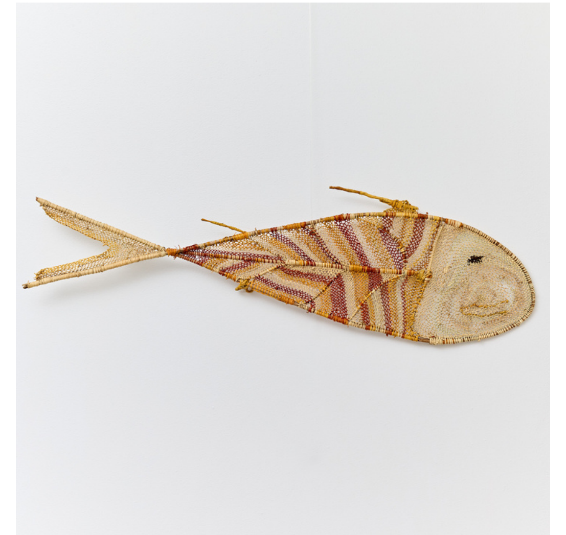
1141-23 Nguykal (Golden Trevally) by Maureen Ali (Maningrida) Pandanus (Pandanus Spiralis) and Bush Cane (Flagellaria Indica) with Natural Dyes 34cm H x 110 cm W $430.00