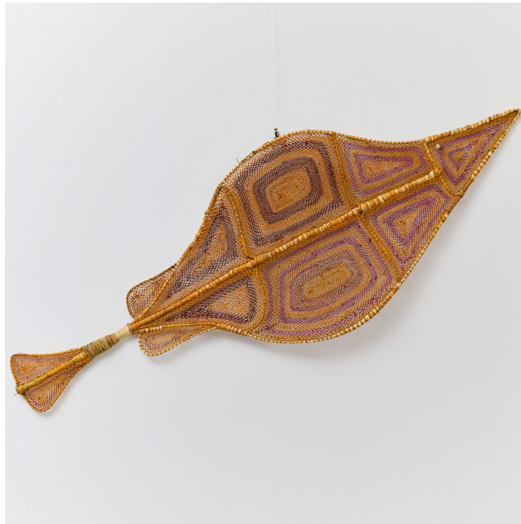
1069-23 Birlmu or Namarnkorl (Barramundi) by Samantha Malkudja (Maningrida) Pandanus ( Pandanus Spiralis ) and Bush Cane ( Flagellaria Indica ) with Natural Dyes 50 cm H x 140 cm W $1,290.00