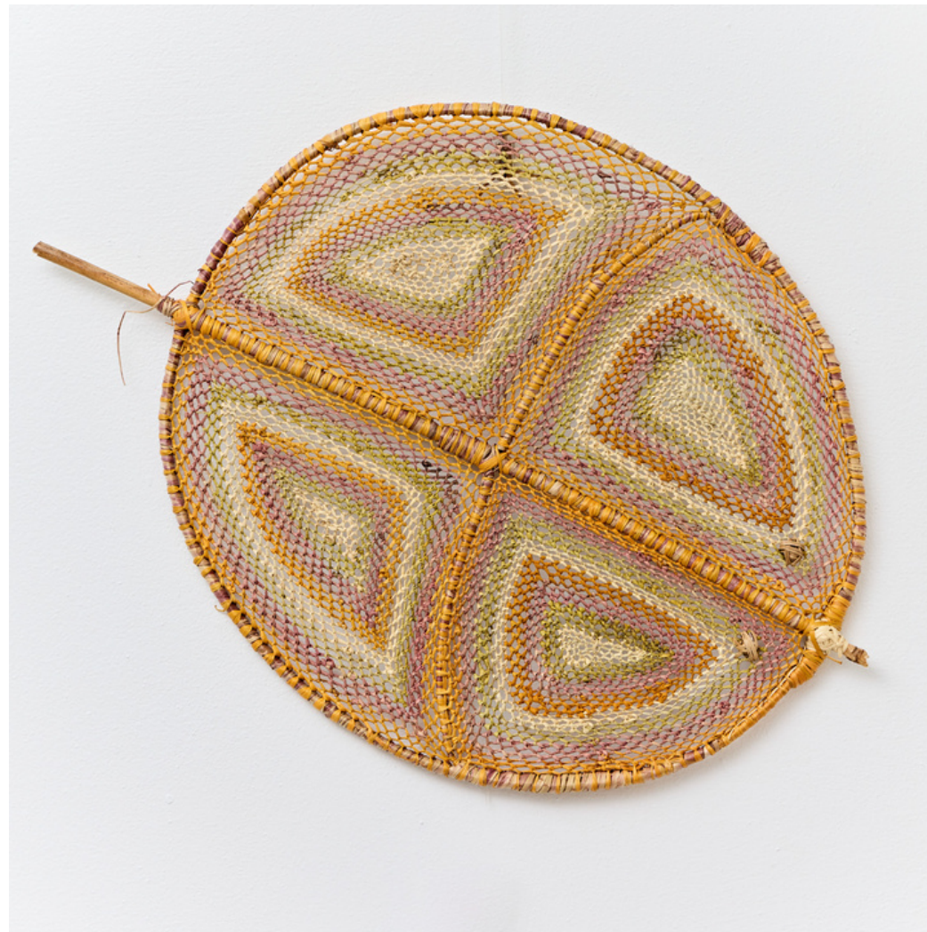
3516-22 Pandanus Weaving (Stingray) by Simplicia England (Marrawuddi) Pandanus and Natural Dyes 41 cm H x 57 cm W $800.00