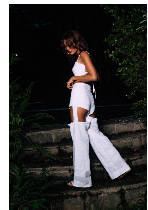
Ramie Linen Chap Pant Black / White