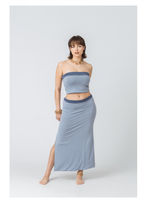
Reversible Bamboo Maxi Skirt Blue / Black / Brown / White