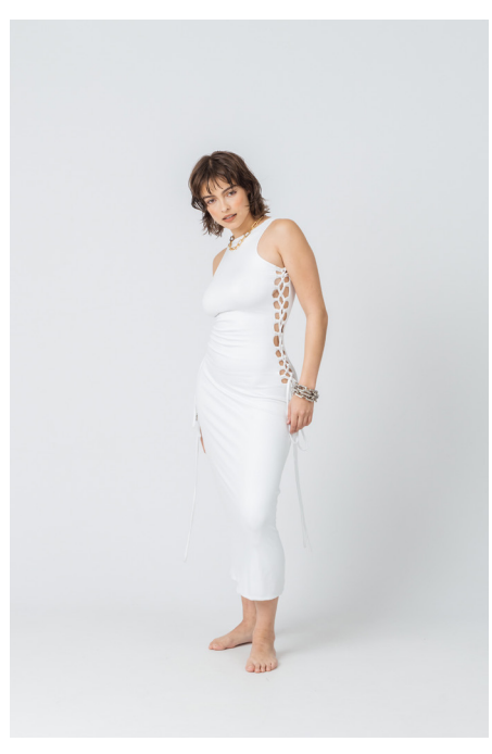
Reversible Bamboo Aquina Dress Blue / Black / Brown / White