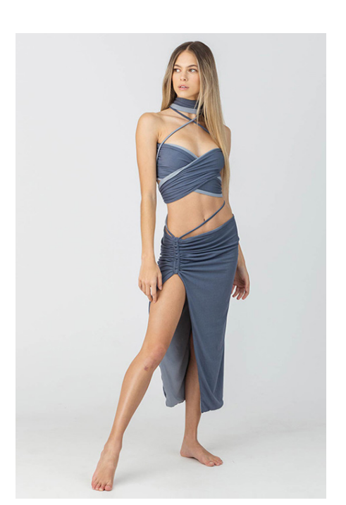
Reversible Or One Colour Bamboo Venus Skirt Blue & Blue / Black & Brown / All White