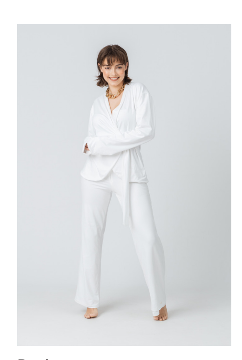
Bamboo Yoga Pant Blue / Black / Brown / White