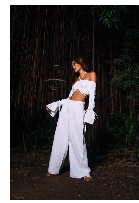
Ramie Linen Platonic Top Black / White