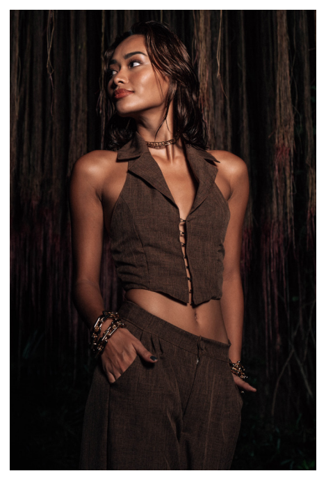
Ramie Linen Vest