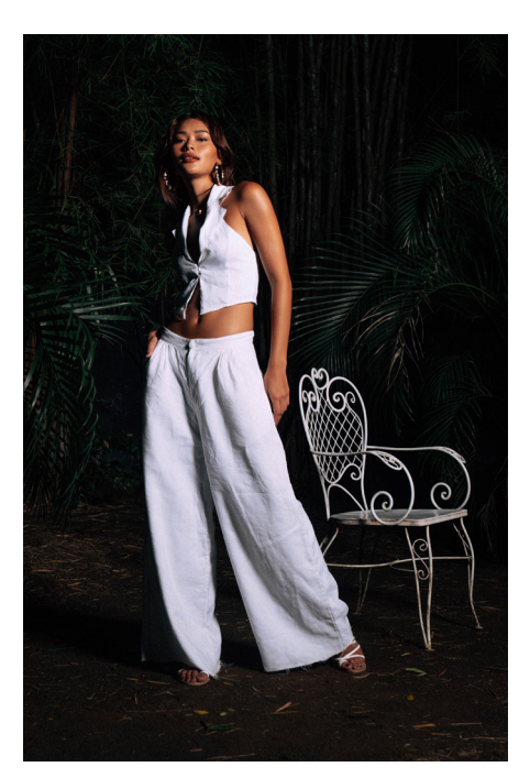
Ramie Linen Ambivalent Pant Black / Brown / White