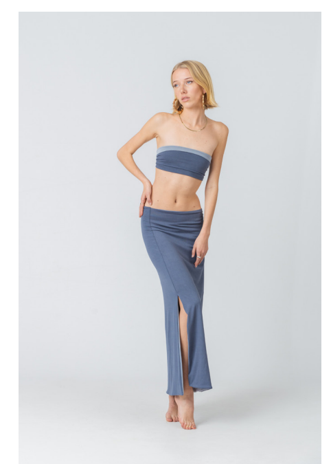
Reversible Bamboo BoobTube Mini Blue / Black / Brown / White