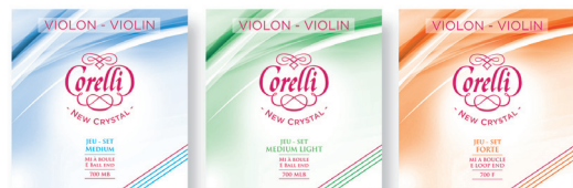
Medium Light Medium High

Available with a Mi-E-1 ball end: ref. 700MLB, 700MB, 700FB or a loop end: ref. 700ML, 700M, 700F.