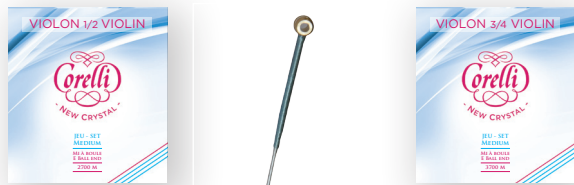
1/2 violin ref. 2700M

with a steel Mi-E-1 ball end. Medium tension.