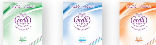
Light Medium High

Also available with a La-A-1 wound on steel: ref. 730LB, 730MB, 730FB.