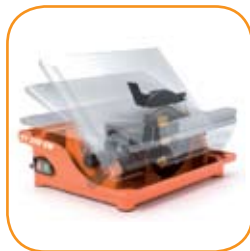
Tilting table (0° to 45°).