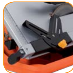
Fast and precise locking cutting device.