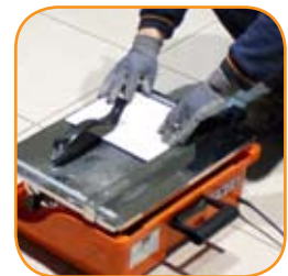
Precise cutting guide.