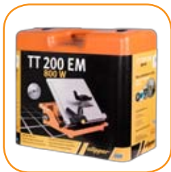
Easy transportation and storage.