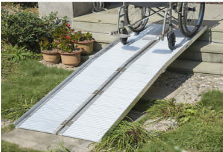
• Bi-Fold Ramp