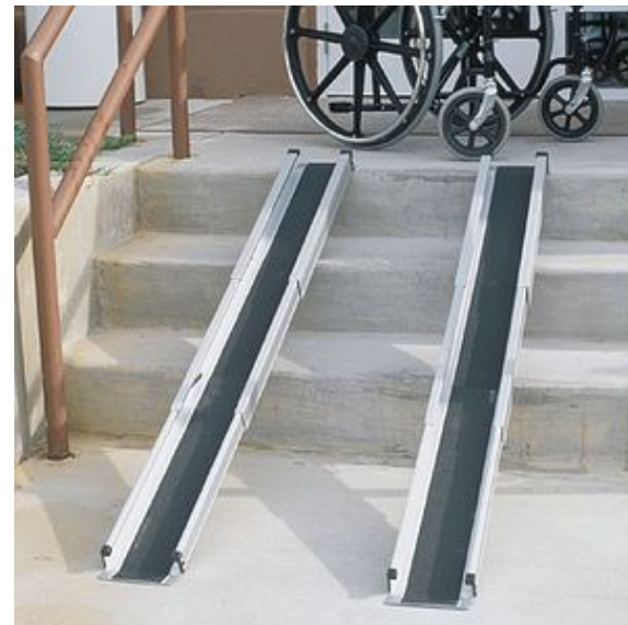
• Telescopic Ramps