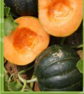
Noir de Carmes Melon