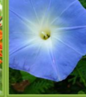
Morning Glory Heavenly Blue