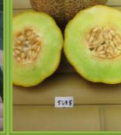
Muncher Early Hanover Melon