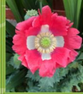
Danish Poppy Flower