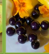
Milatomato Vallista Berry