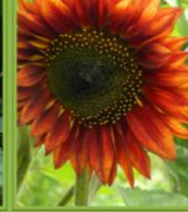
Evening Colours Sunflower