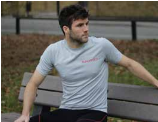
▲ ECO CHARGE ▲