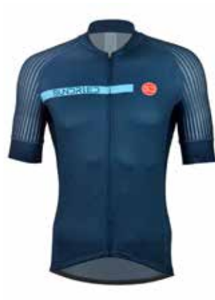
▲ PRO SHORT SLEEVED JERSEY ▲