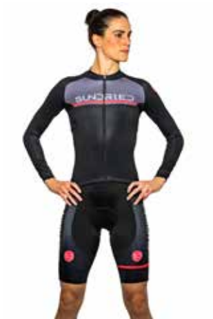
▲ TRAINING COLLECTION ▲