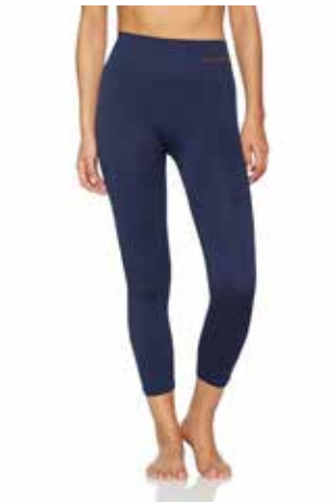
▲ RUINETTE CAPRIS ▲