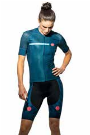
▲ PRO RANGE CYCLE KIT ▲