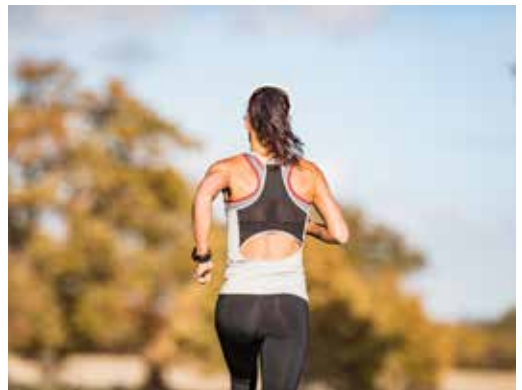
▲ RECYCLED FABRICS ▲