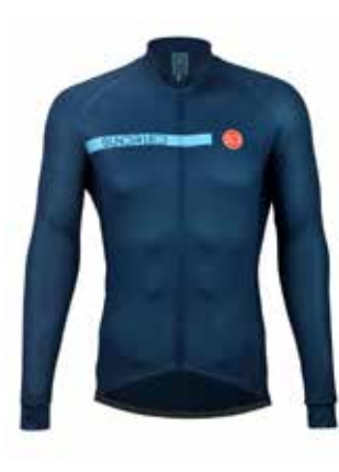
▲ PRO LONG SLEEVED JERSEY ▲