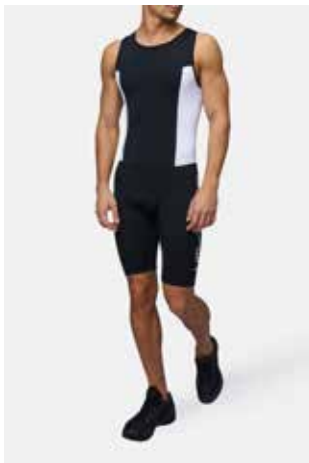
▲ MEN'S TRI SUIT ▲