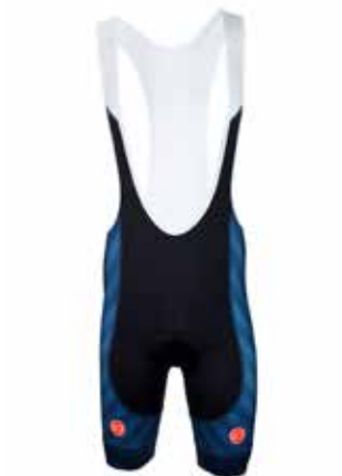
▲ PRO RANGE BIB SHORTS ▲