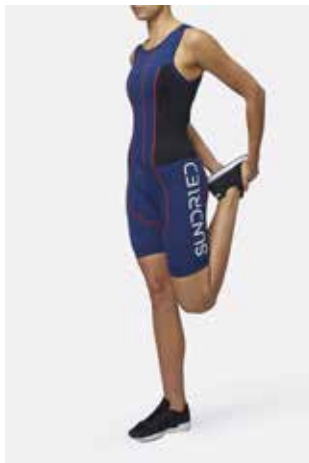
▲ WOMEN'S TRI SUIT ▲