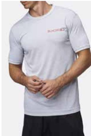
▲ OLPERER T-SHIRT ▲