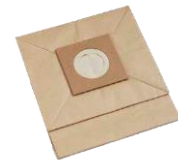
Dust Bag Easy disposal, 4L max capacity