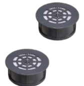
HEPA Filter Captures 99.97% of PM2.5 particles, including pollen and dust