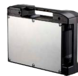
Battery Swappable lithium ion battery