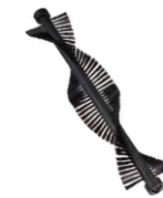
Brush Removable rotating brush, auto height adjusting