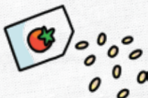
organic cherry tomato seeds