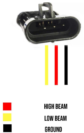
RZR 1000 PINOUT