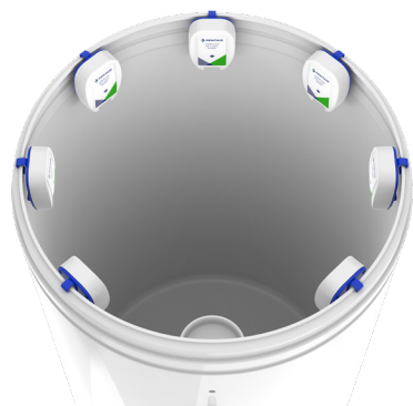
ROUND BRINE TANK