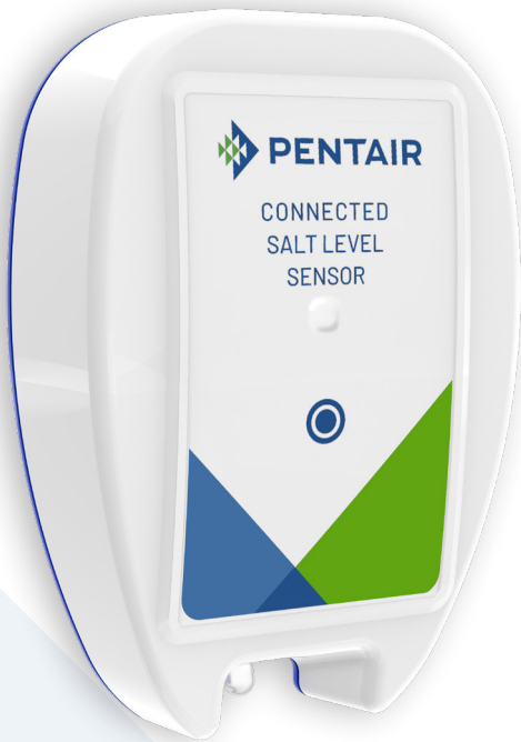
Part No. 4005702