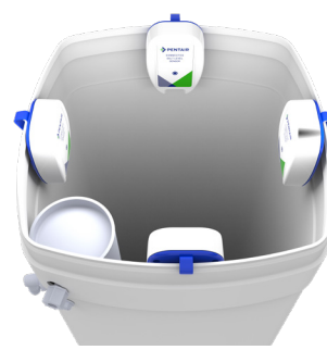
SQUARE BRINE TANK

Note: Visuals above indicate potential positions for the Connected Salt Level Sensor within the brine tank. Only one sensor is needed per brine tank application.