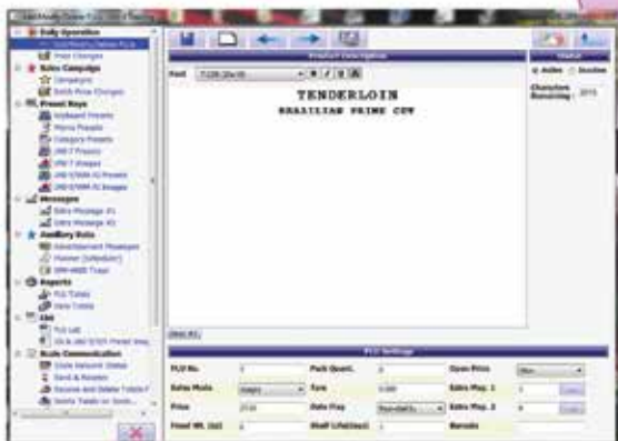
PLU Edit Screen