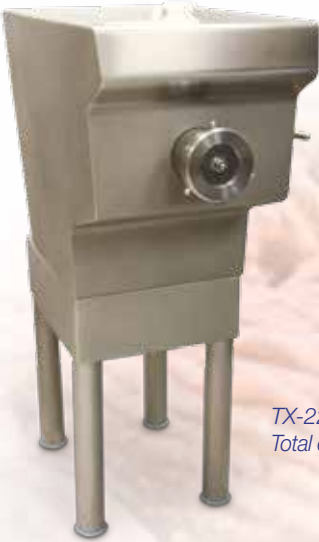
TX-22 Grinder shown on optional stand. Total dimensions: 45" H x 28.25" D x 17" W

best grind over a longer period. Its single-piece crankcase and 1-hp motor are designed to power through long jobs without overheating or jamming. The stainless steel construction combined with smooth corners, sealed seams and easily removable parts make for quick and easy clean-up and sanitation every time.