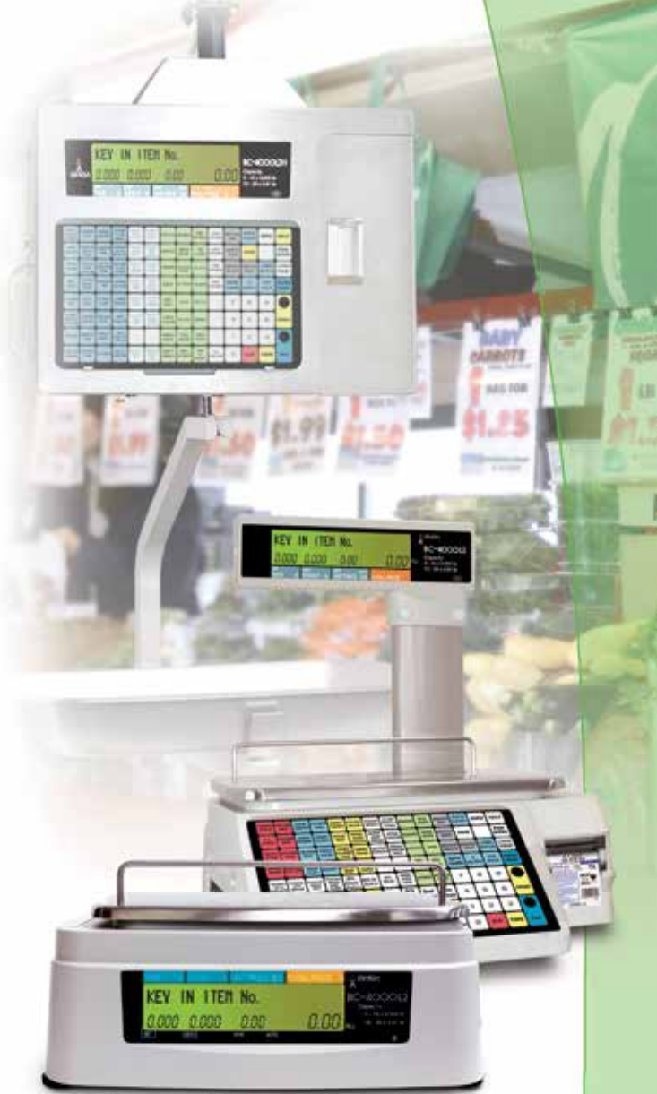
Bench scale customer view