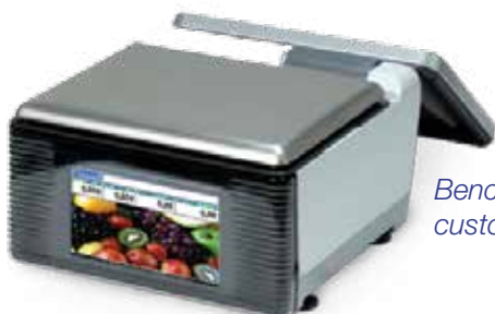
Bench scale customer view

The Uni-9 bench scale is available with or without a 7-inch customer display and is ideal for both back-room production and front counter operation. This Uni-9 model offers wireless remote operation allowing for more flexible placement.