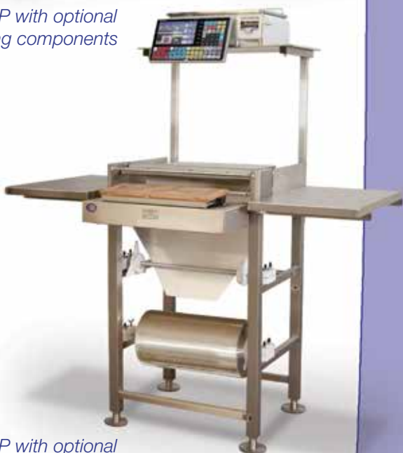
Uni-7 RP with optional wrapping components