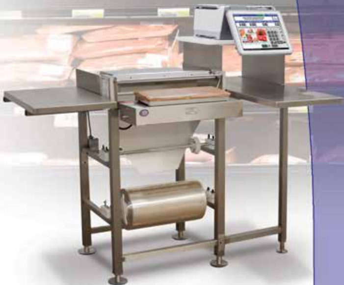
Uni-9 RP with optional wrapping components