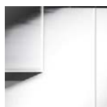
Polished Chrome (CROM)