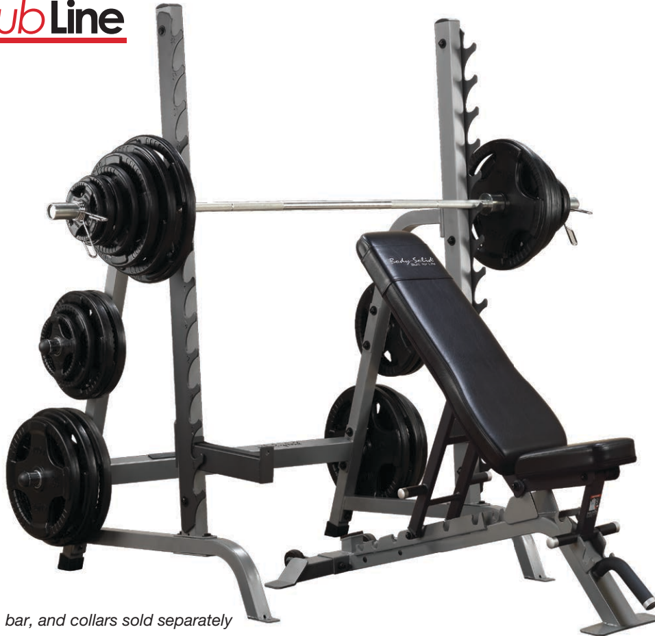
*Weights, bar, and collars sold separately