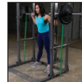
Band Pegs PPRBP