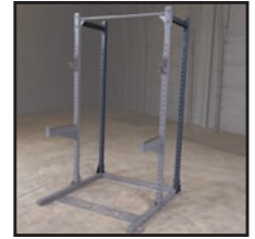
Half Rack Extension PPR500EXT