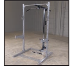
Lat Attachment PLA500