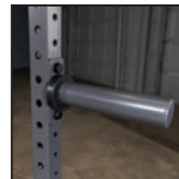
Weight Horn PPRWH