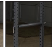
Pipe & Pin safeties PPRPS