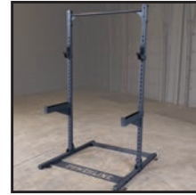
Half Rack PPR500

Base Unit Weight: 112.6 lbs Base Unit Dimensions: 50.2"L x 50.9"W x 83"H