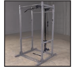
Lat Attachment PLA1000