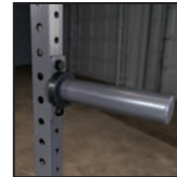
Weight Horn PPRWH