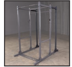
Power Rack Extension PPR1000EXT