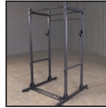
Power Rack PPR1000