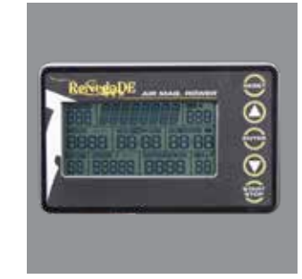
Console A large LCD screen with several workout programs, which tracks and display your progress