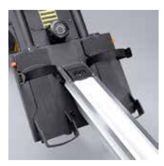
Footrests Engineering oversized footrests, easy to adjust