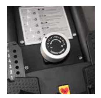
Résistance réglable 8 niveaux, manuel