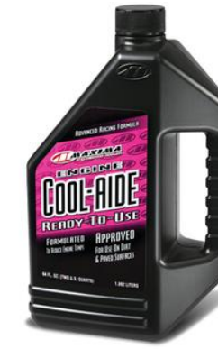
Motorcycle Maintenance :- Engine Coolant