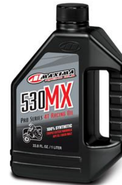
Racing Oils :- 530MX "Triple Esters" Fully Synthetic