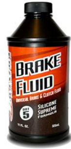
DOT 5 Brake Fluids