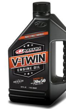
VTwin Oils :- Mineral