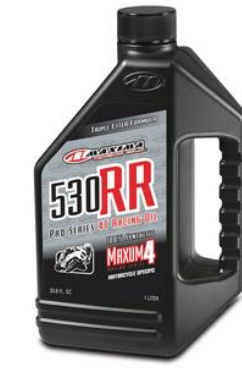
Racing Oils :- 530RR "Triple Esters" Fully Synthetic