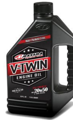
VTwin Oils :- 100% Synthetic Motorcycle Oil