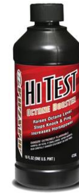
Octane Booster - 'Hi Test'