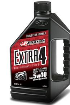
Fully Synthetic Oils :- with Triple Esters (EXTRA)