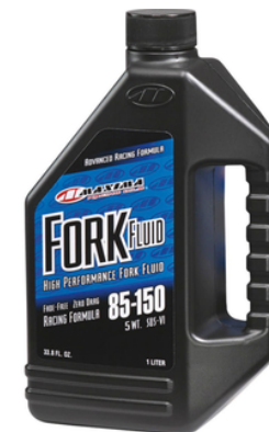
Maintenance :- Racing Fork Suspension Fluids