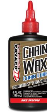
Bike Chain Wax