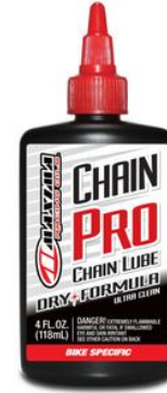
Bike Chain Pro Chain Lube