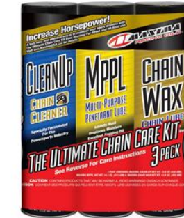
Chain Maintenance :- Three System Combo Kit