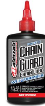
Bike Synthetic Chain Guard