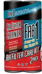
Air Filter cleaner + Air Filter Oil Spray