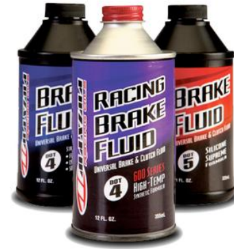
DOT4 and DOT4 Racing Brake Fluids