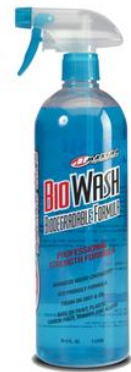
Bio Wash Cleaner