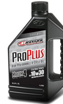
Fully Synthetic Oils :- with Ester Fortification (PROPLUS+)