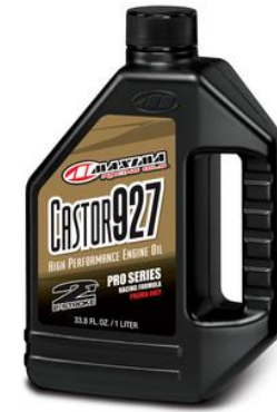
Two Stroke Oils :- Carb engines 'Castor 927'