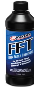
FFT (Foam Filter Treatment)