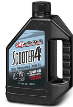
Premium Scooter Mineral Oils - Scooter 4T