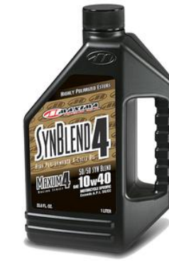
Semi Synthetic Oils:- with pure minerals + Esters(SYNBLEND)