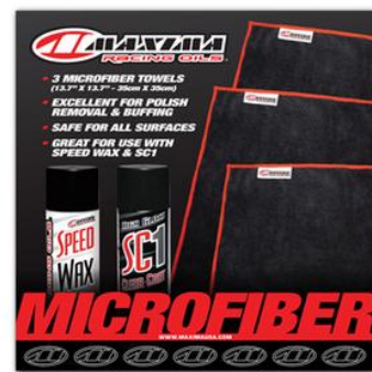
Maintenance :- Micro Fiber Cleaning Cloth (3-pack)