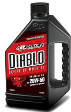
Premium Scooter Mineral Oils - Diablo 4S