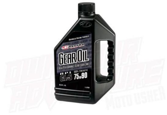
Transmission Oils :- Synthetic Gear Oil