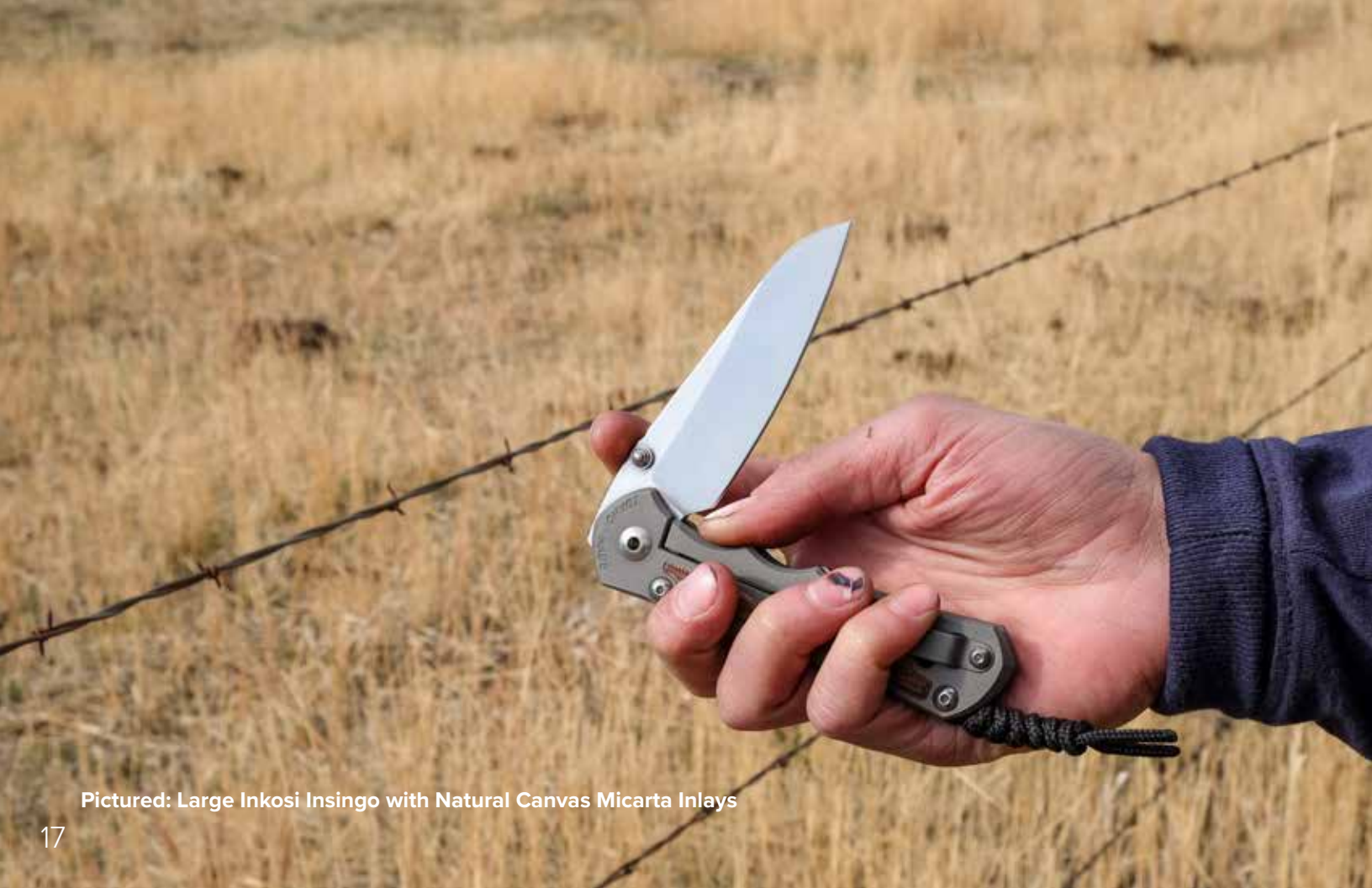
Pictured: Large Inkosi Insingo with Natural Canvas Micarta Inlays