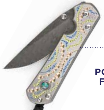
SATIN POLISHED FINISHES