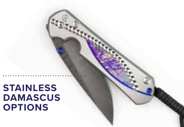
STAINLESS DAMASCUS OPTIONS