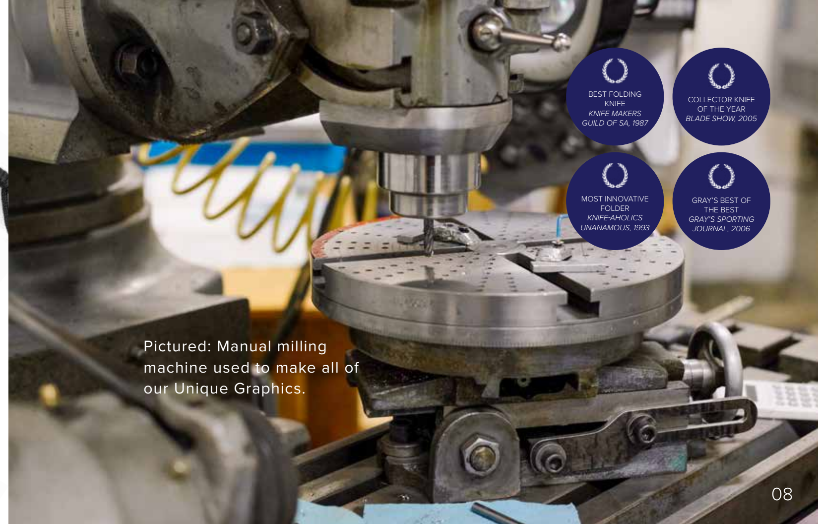
Pictured: Manual milling machine used to make all of our Unique Graphics.