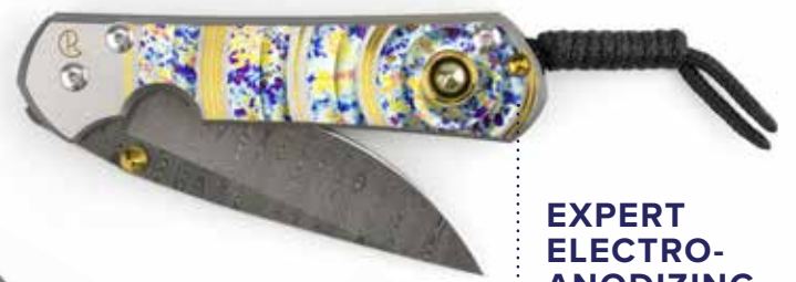
EXPERT ELECTRO- ANODIZING