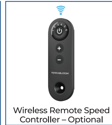
Wireless Remote Speed Controller - Optional