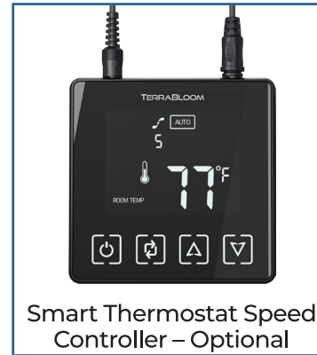
Smart Thermostat Speed Controller - Optional