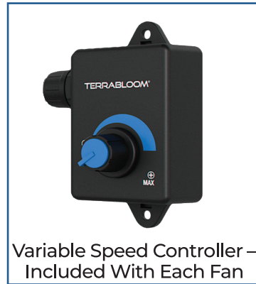
Variable Speed Controller - Included With Each Fan