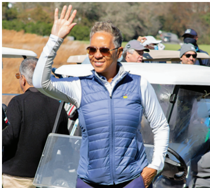
TENNIS STAR KATRINA ADAMS