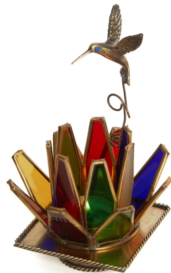
The flower of Persistence