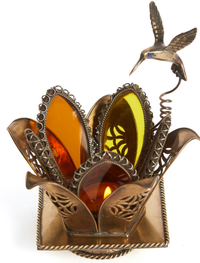
The flower of Humbleness