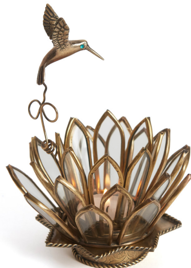
The flower of Acceptance