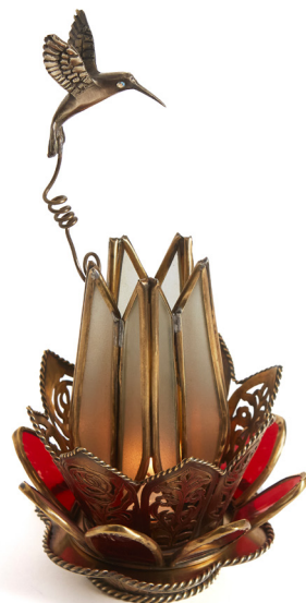
The flower of Worthiness

(*) Measured on support with hummingbird