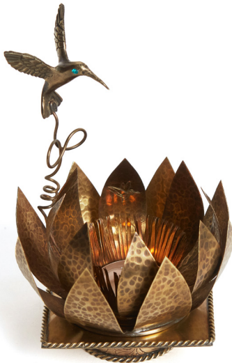
The flower of Confidence