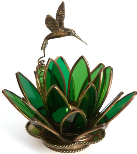
The flower of Gratitude

Before we aim up into the vast potential of possibilities and create ourselves a vision, we need to nurture our inner foundation. The following four virtues make up the fertilizers of this foundation.