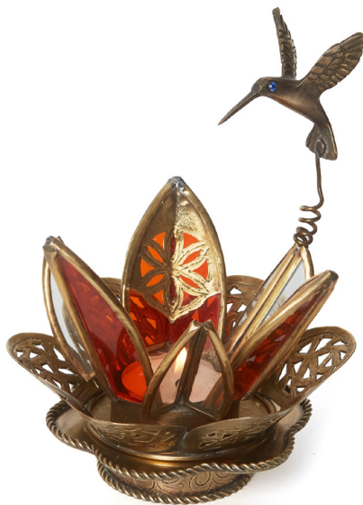
The flower of Clarity