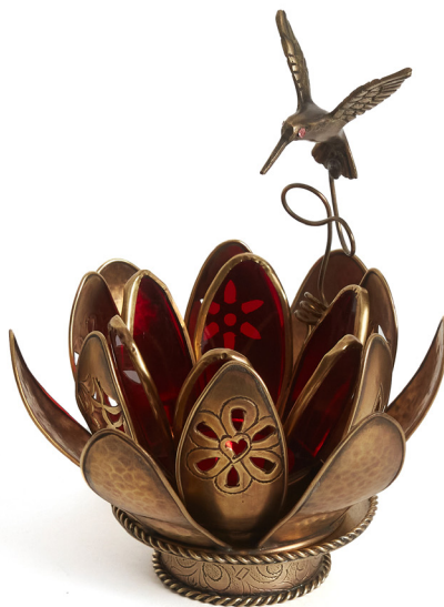
The flower of Compassion