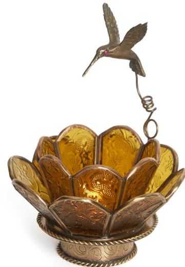
The flower of Kindness