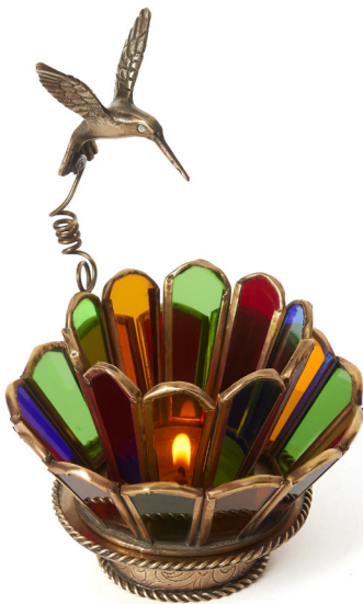
The flower of Patience