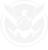
PLATE ANNOUNCES USPTO HAS GRANTED REISSUE PATENT RELATING TO ACEM® PISTOL LOADER PLATE, LLC

PLATE LLC FLORIDA, USA WWW.PLATE.US INFO@PLATE.US CAGE 7XR52