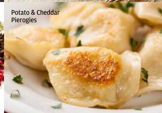
Potato & Cheddar Pierogies