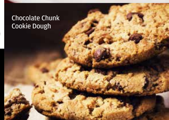
Chocolate Chunk Cookie Dough