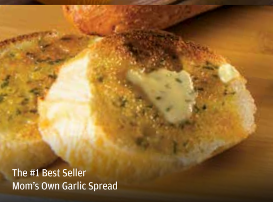
The #1 Best Seller Mom's Own Garlic Spread