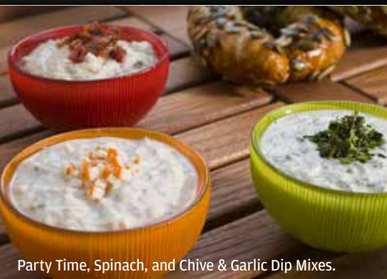
Party Time, Spinach, and Chive & Garlic Dip Mixes.