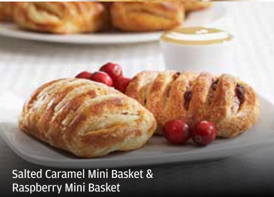
Salted Caramel Mini Basket & Raspberry Mini Basket

Add Mom's hemp, chia, or flax to your smoothies for added texture and health benefits.