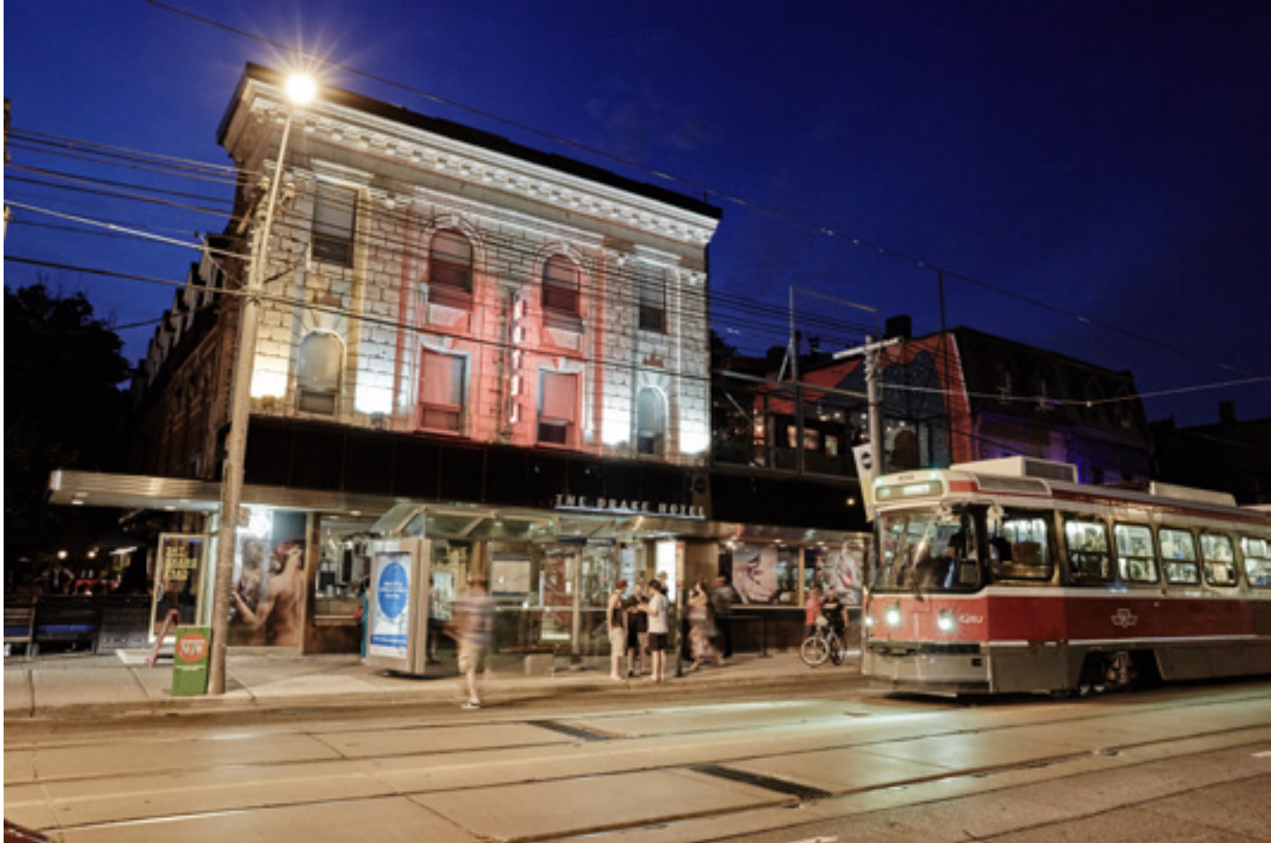
Queen St. W. & Beaconsfield Ave.