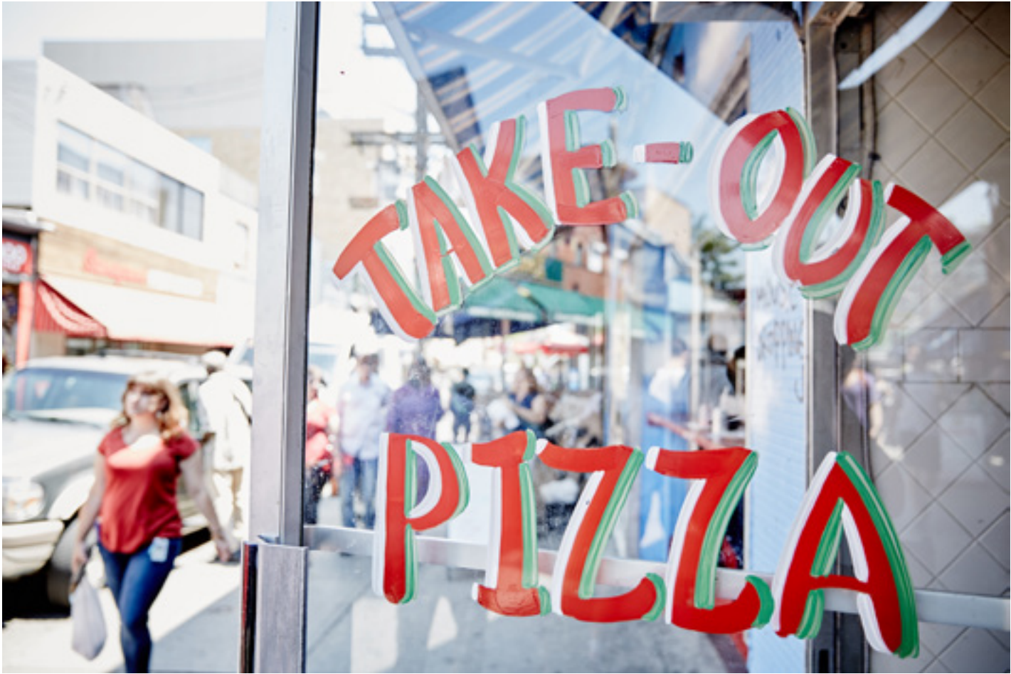
Baldwin St. & Kensington Ave.