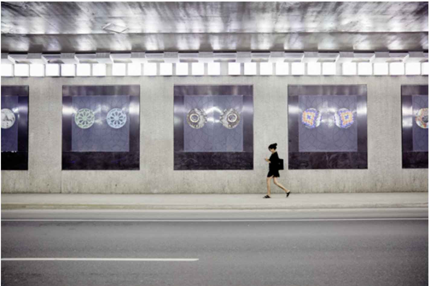
Dufferin St. & Queen St. W.