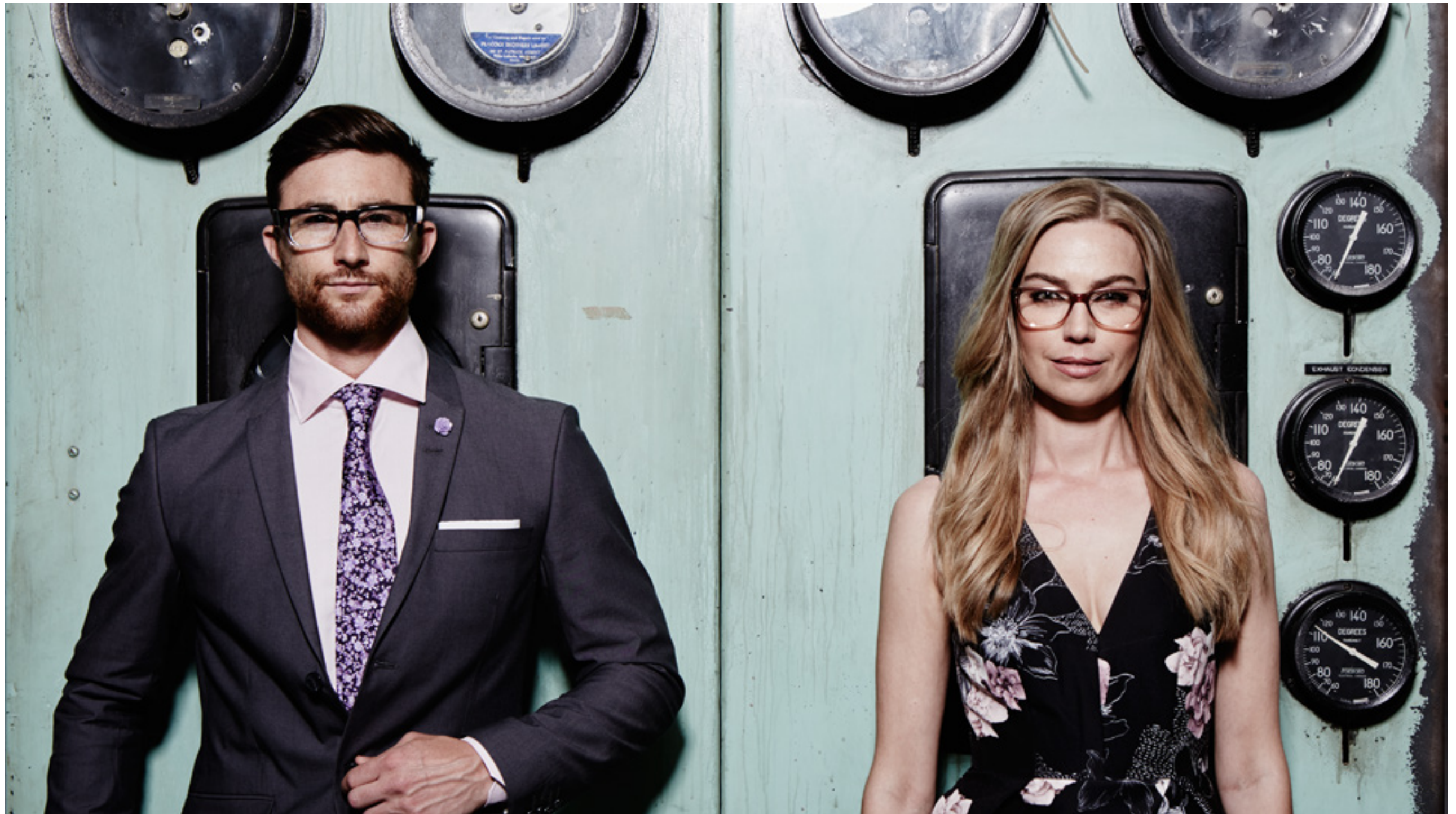
Garrison Rd. in Dark Grey Crystal Fade