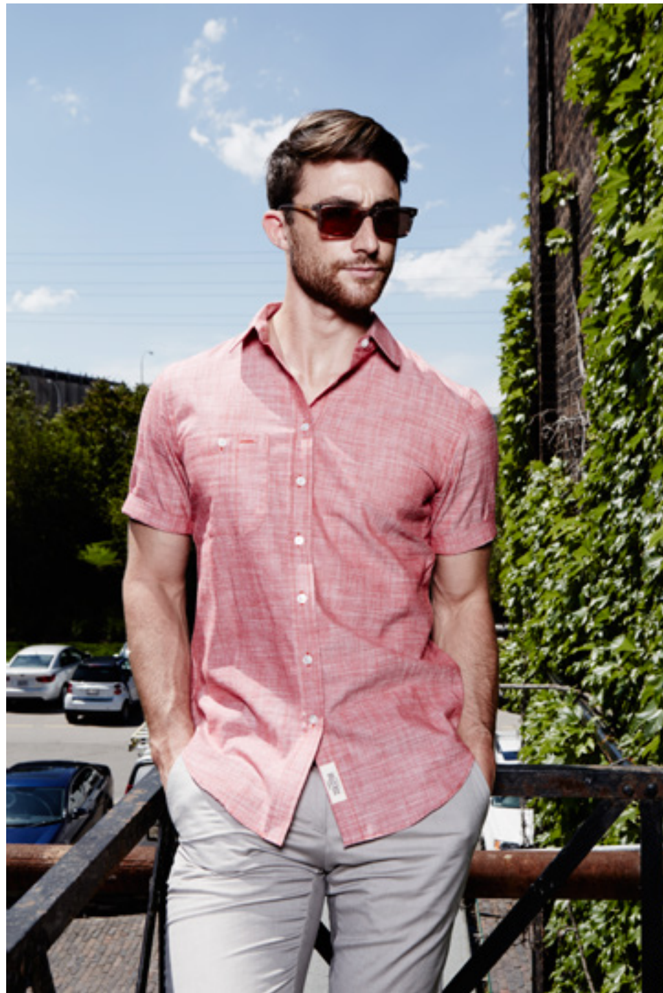
Stafford St. in Grey with Miele Temples