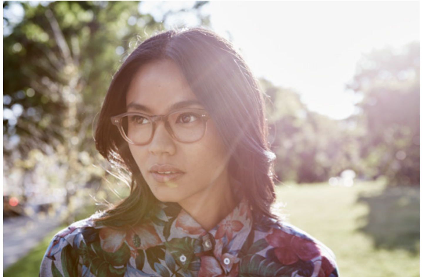
Rushton Rd. in Peach Brown Fade