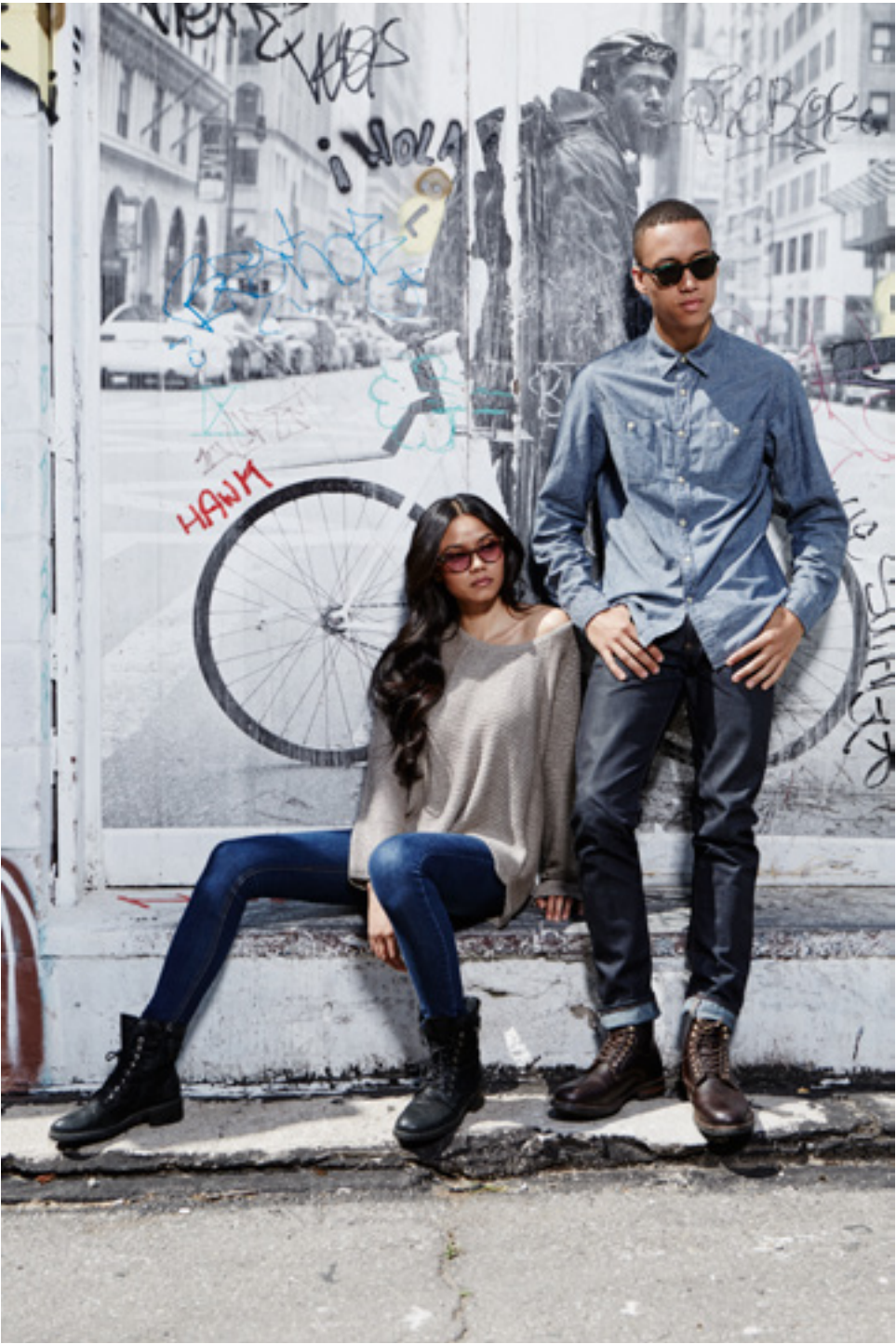
Hers: Trinity St. in Violet Amber Tort His: Governor Rd. in Dark Green